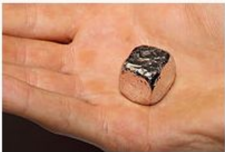
A 78 g sample of rhodium