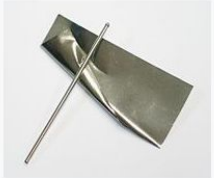
Rhodium foil and wire