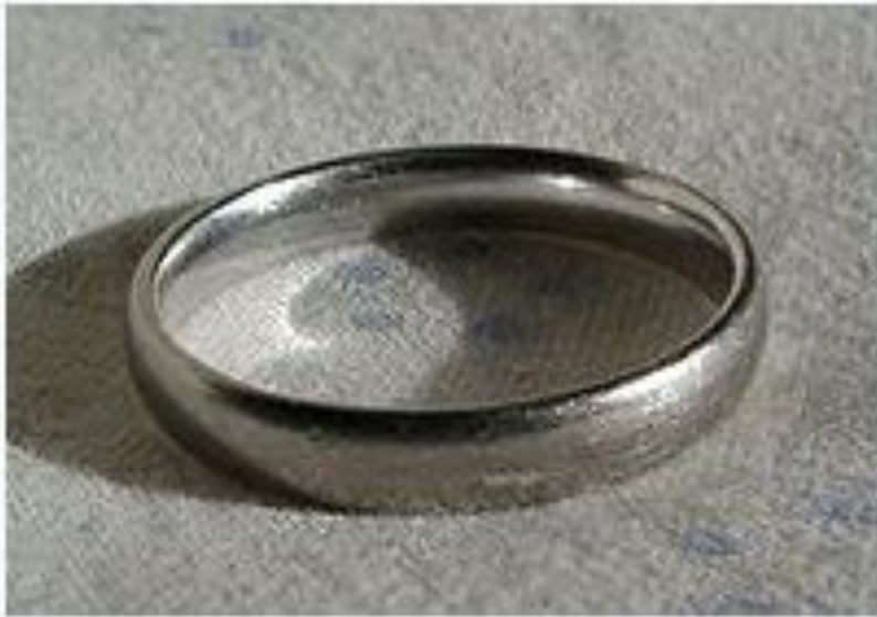
Rhodium-plated white gold wedding ring