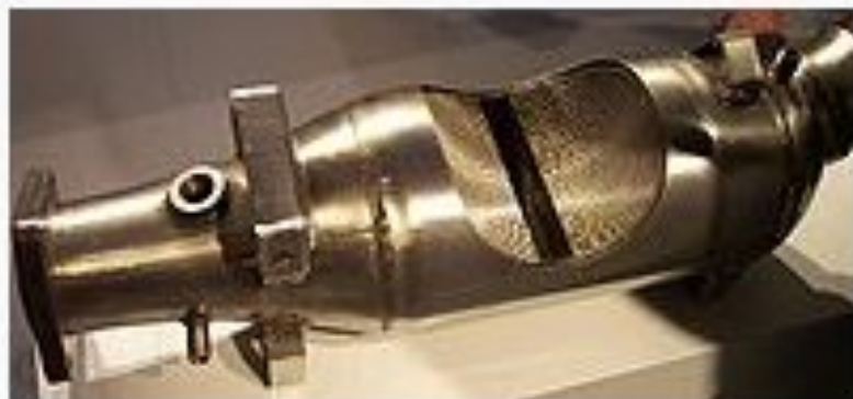
Cross section of a metal-core catalytic converter