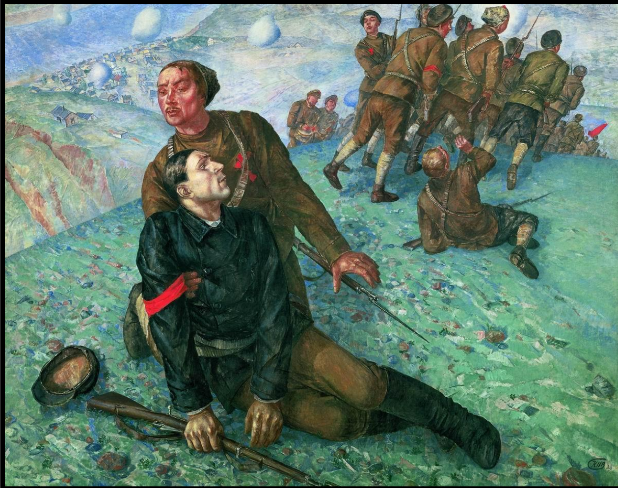
Petrov-Vodkin. Death commissioner

The Russian Museum houses a collection of Soviet paintings.