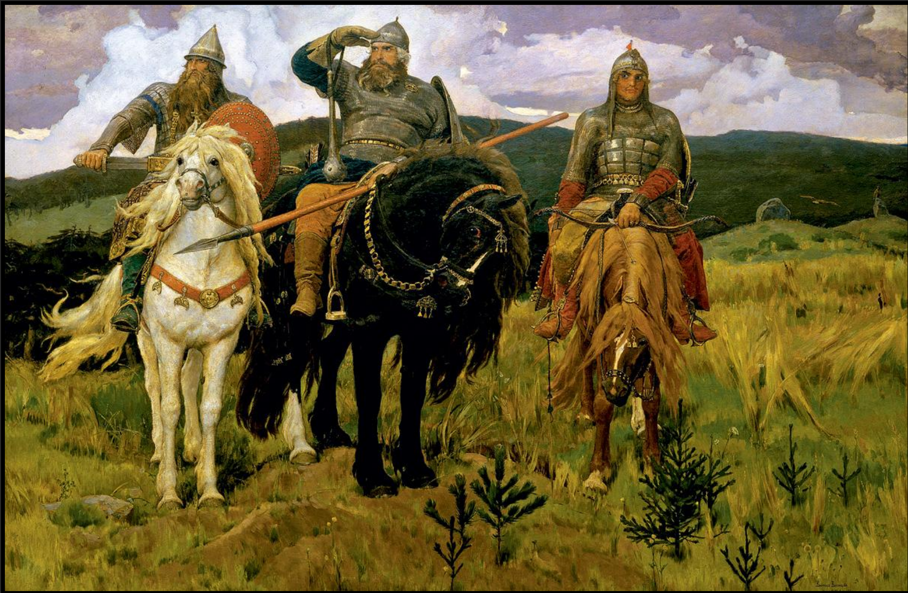
Victor Vasnetsov. Three heroes