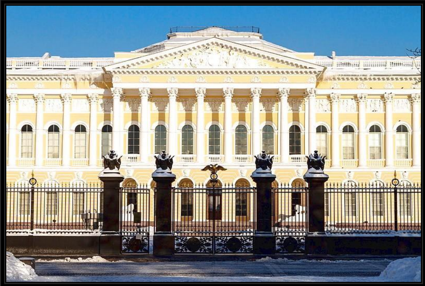
State Russian Museum

The State Russian Museum is the largest museum of Russian art in the world.