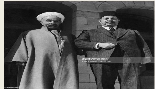
Prime Minister Mahmoud an-Nukrashi