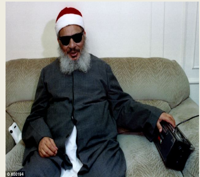
Shaykh Umar Abd al- Rahman