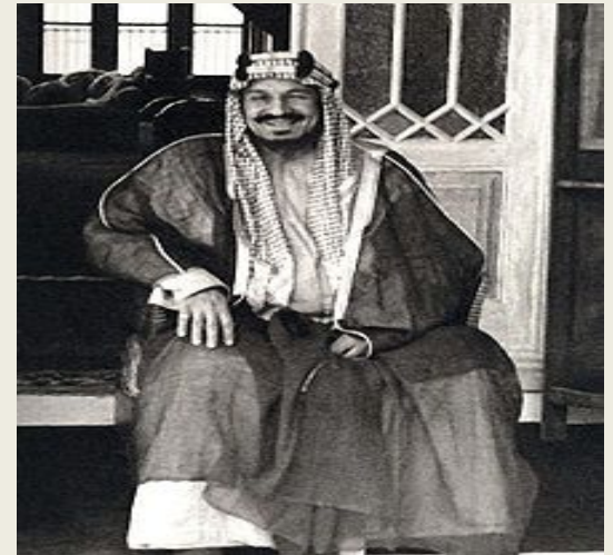
Abdulaziz Ibn Al Saud