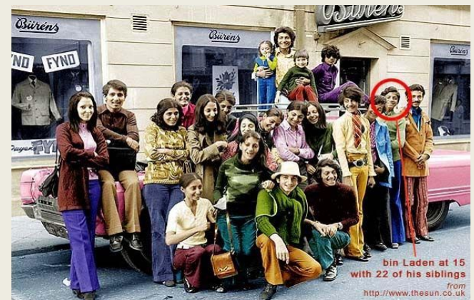
bin Laden at 15 with 22 of his siblings