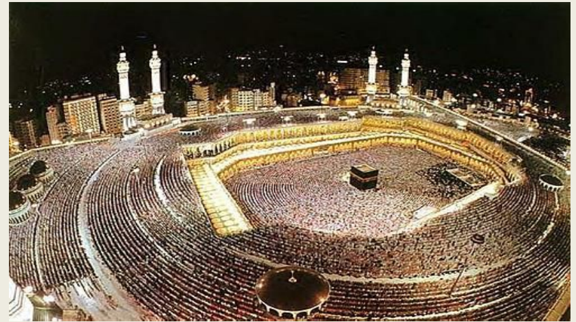
Kaaba in Mecca