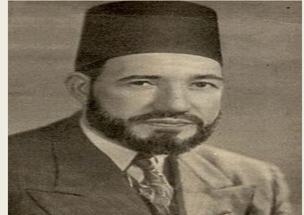
Hassan al Banna