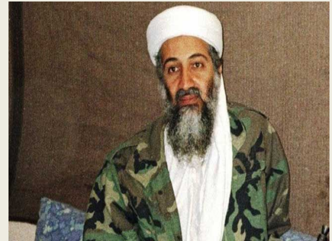
Osama bin Laden