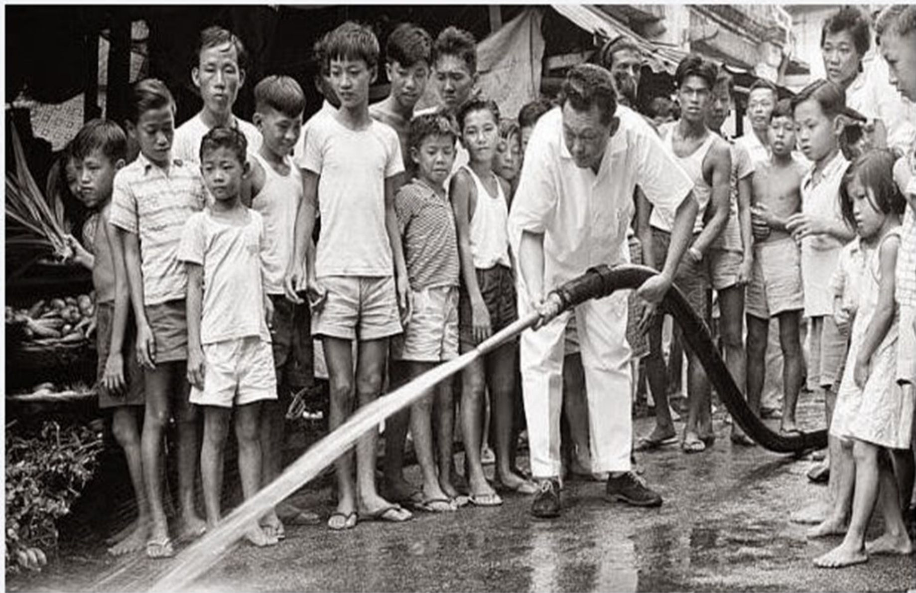
NOV 23, 1959 (above): Prime Minister Lee Kuan Yew (centre) leading a mass drive to spring-clean the city for the National Loyalty Week in December.