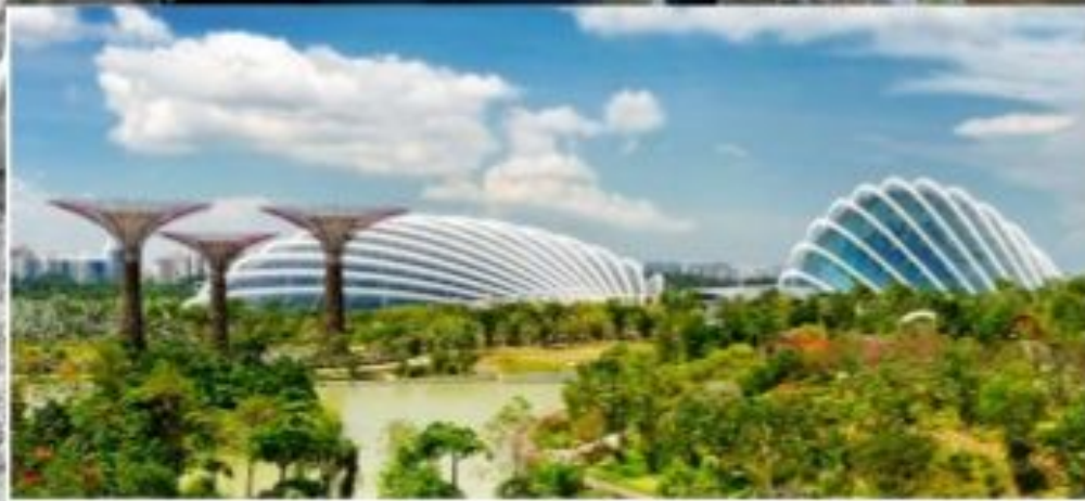
1963 and 2013: The Green City. Lee Kuan Yew planted a mempat tree to start an island wide tree-planting campaign. Five decades later, he returned to Farrer circus to plant a rain tree.