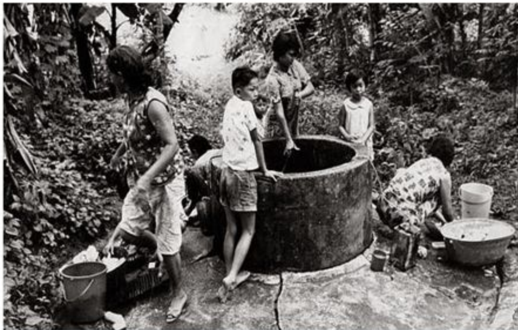
Villagers in Adam Park washing clothes near a well. In the early 1960s, people who lived in kampungs had to draw water from common wells. In an effort to improve standards of living across Singapore, Mr Lee ensured that homes had access to taps from which potable water flowed.