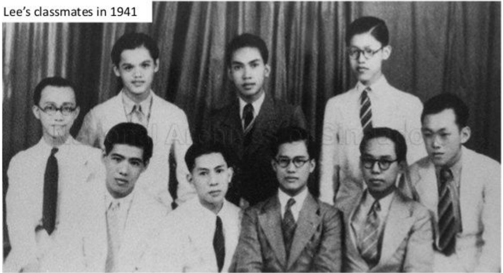
Lee's classmates in 1941

1941 to 1945: The Japanese Occupation of Singapore put Lee's education on hold. He escaped the Sook Ching massacre by asking to leave Jalan Besar Stadium to collect his belongings.