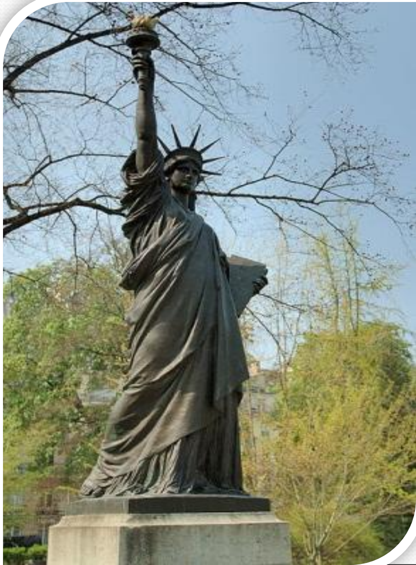
In the Luxembourg Garden