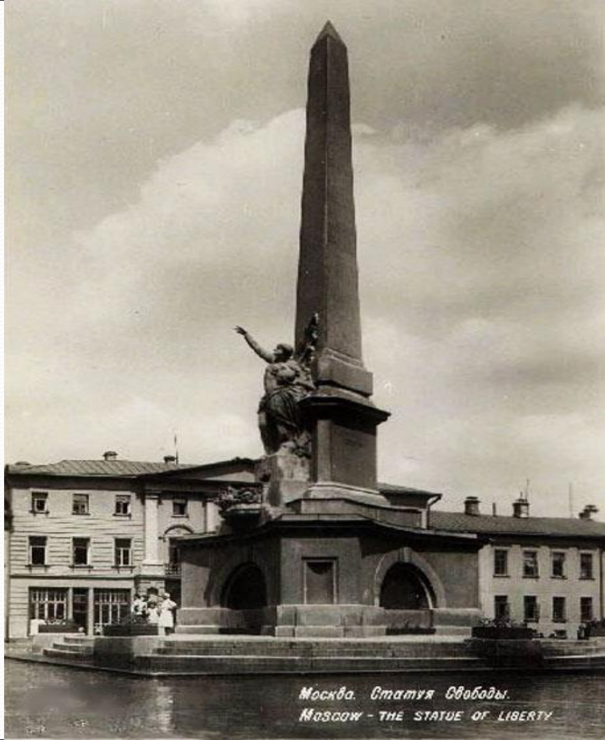
Москва. Статуя Свободы. MOSCOW - THE STATUE OF LIBERTY

On April 22, 1941, a dilapidated monument was destroyed.