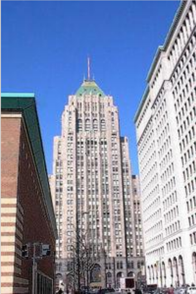
The Fisher Building, located in the City's New Center area, home to the Fisher Theatre.