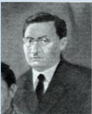
Ilyas Zhansugurov (1894-1938)

He is the author of «Kulager». Arrested, the name of the recovered after the XX Congress of the CPSU.