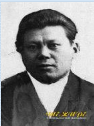
Beiimbet Maylin (1894-1938)

He is the author of «Kulager». Arrested, the name of the recovered after the XX Congress of the CPSU.