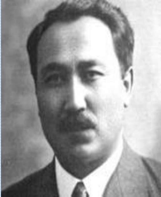
Saken Seifullin (1894-1938)

S.Seifullin stood at the origins of the Kazakh Soviet literature.