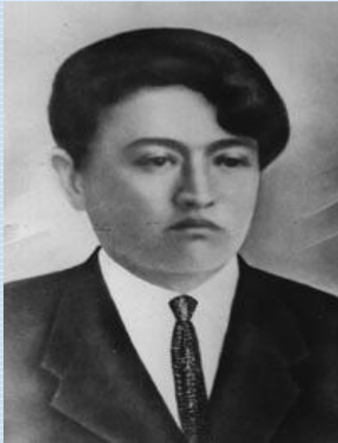
Magzhan Zhumabayev (1893-1938)

Magzhan Zhumabayev has made a variety of genres in Kazakh poetry, continued the tradition of Abai, wrote on topics of love poetry, a poem about the Civil War.