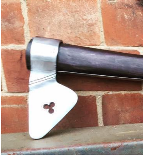
Angle of striking part