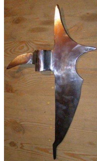
Weapon with spikes