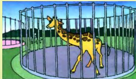
In the zoo