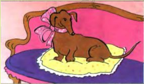
In the house