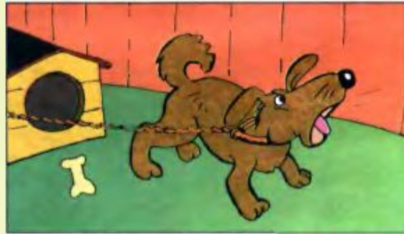
In the yard