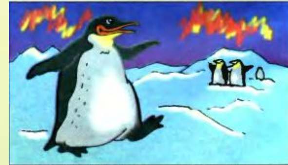
In cold winter