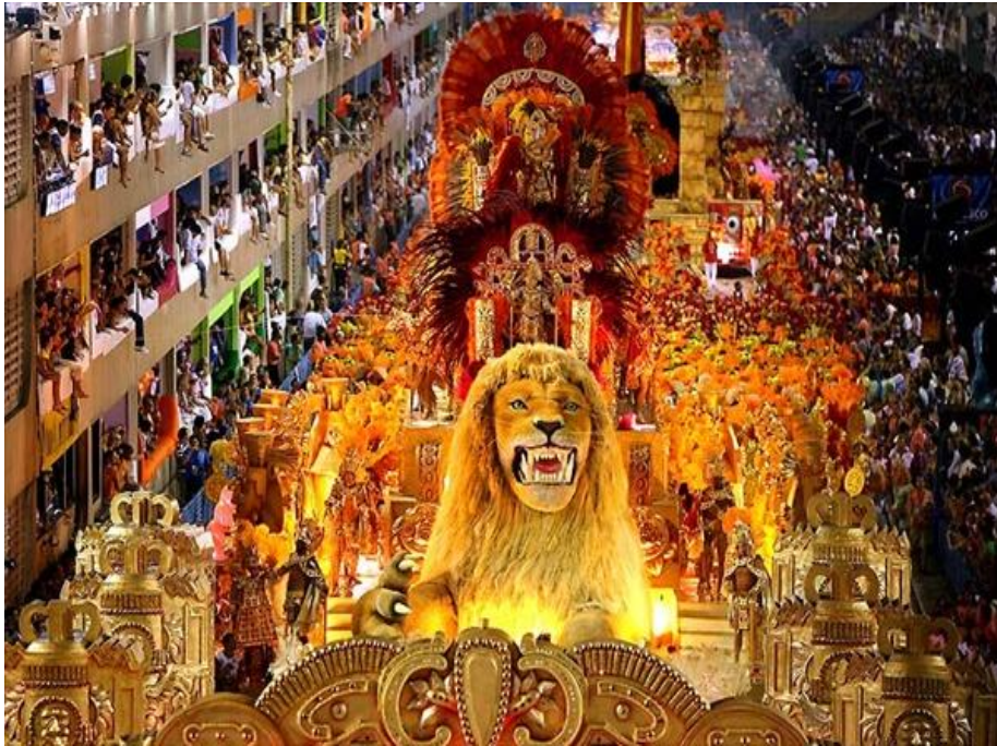
Carnival in Rio de Janeiro

Carnival is a festive season which occurs immediately before Lent; the main events are usually during February. Carnival typically involves a public celebration or parade combining some elements of a circus, mask and public street party. People often dress up or masquerade during the celebrations, which mark an overturning of daily life.