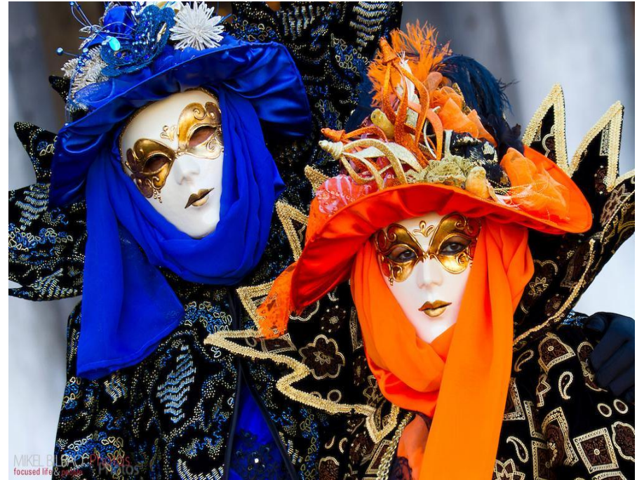
Carnival of Venice