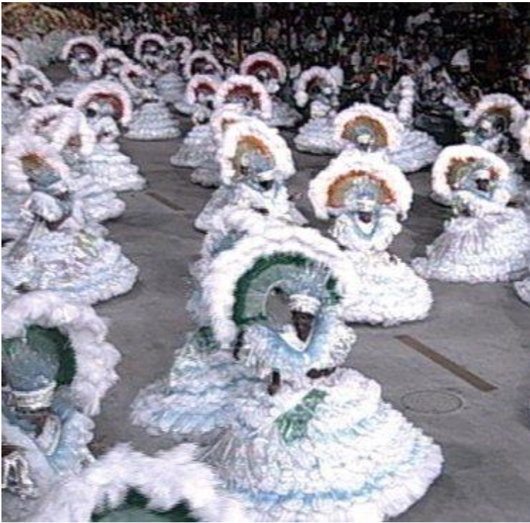
Dancers at the 2005 carnival