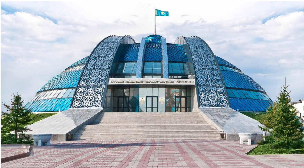
Historical and cultural center Of the first President in Temirtau