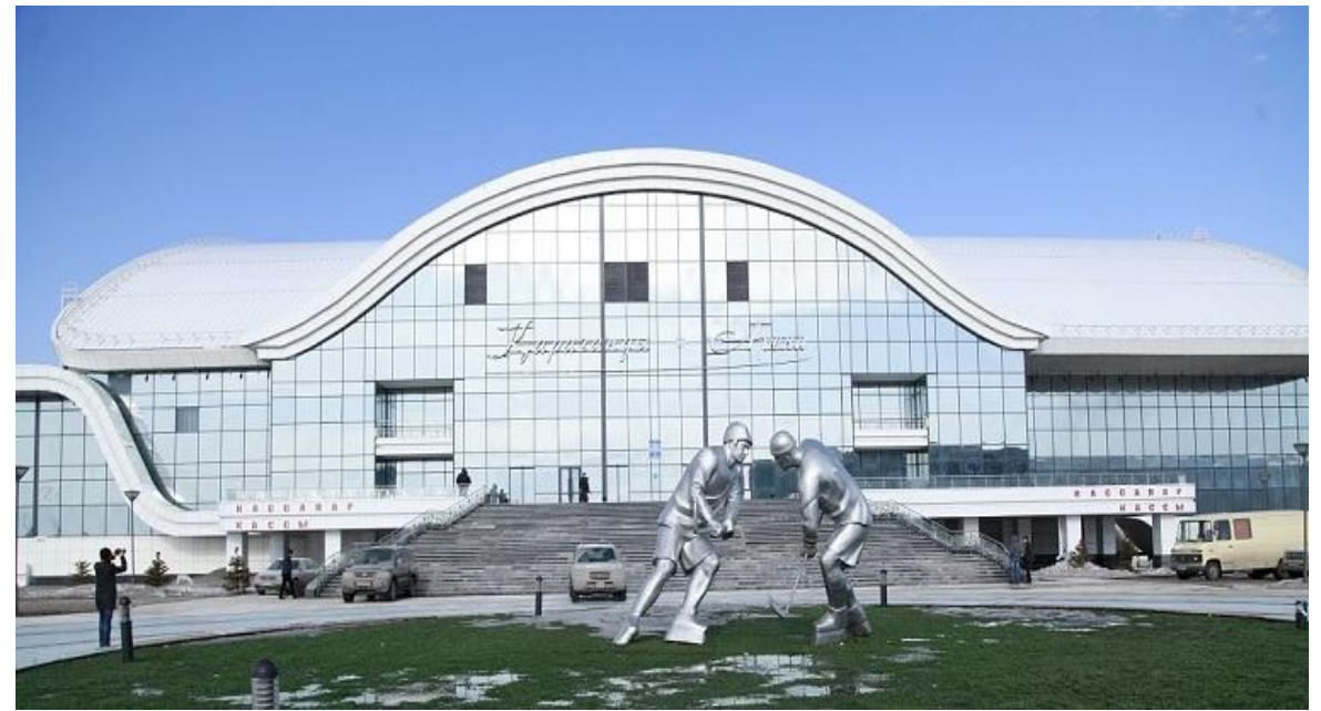
Ice Palace "Karaganda-arena".