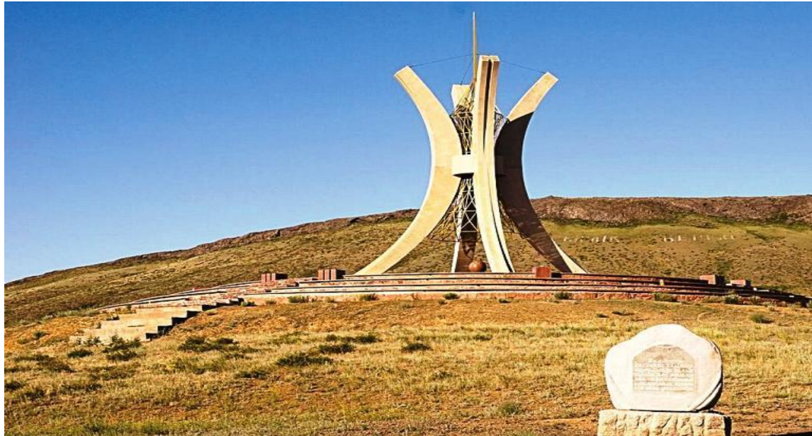
Mausoleum of Akmeshit-Aulie in Ulytau