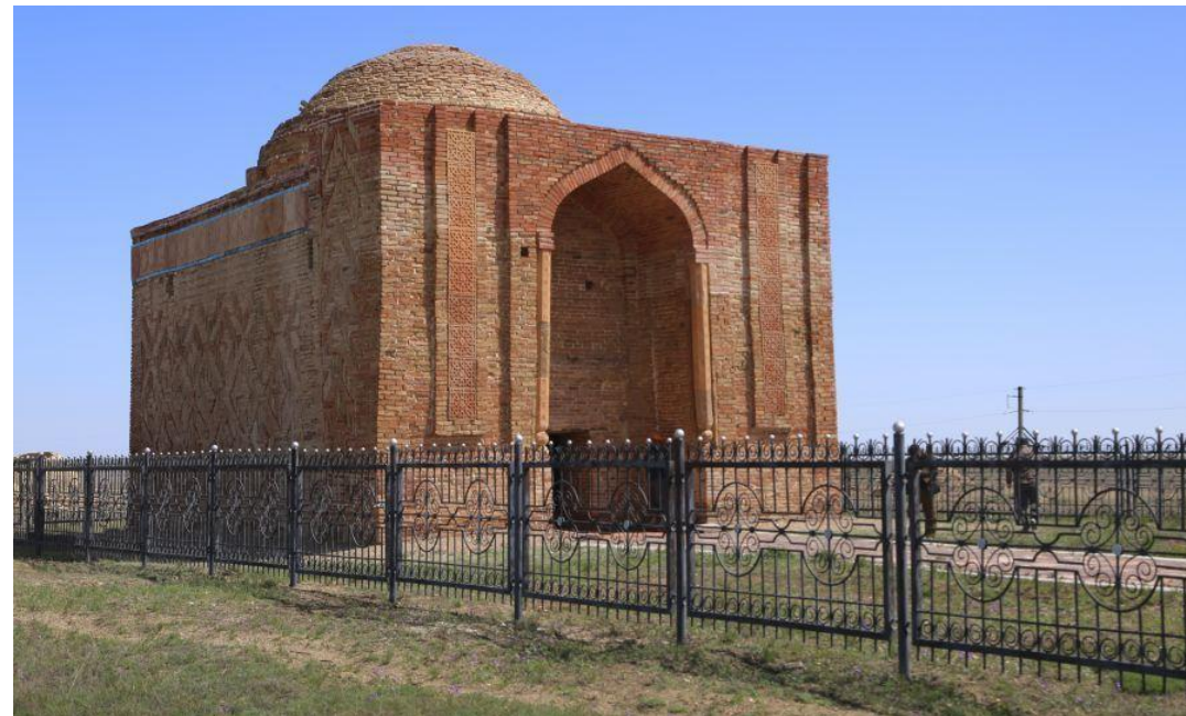
Mausoleum of Alash Khan