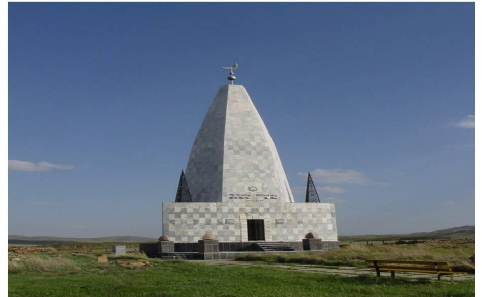
Mausoleum of Bukhara Zhyrau