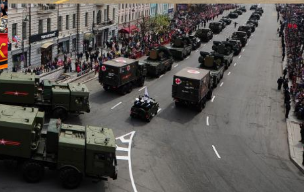
May 9 2017 parade