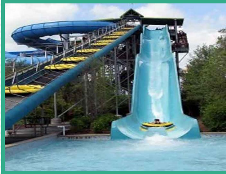
Adventure Island: Tampa, Florida