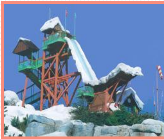
Blizzard Beach: Orlando, Florida