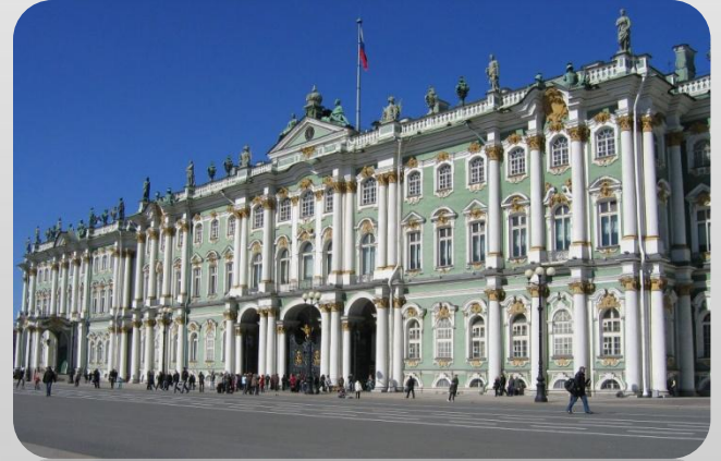
The State Hermitage Museum