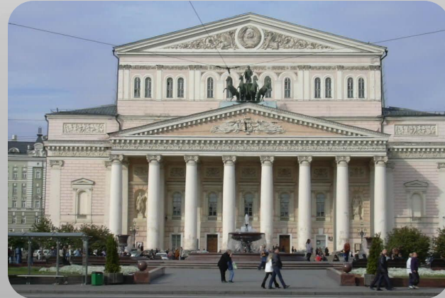
The Bolshoi Theater