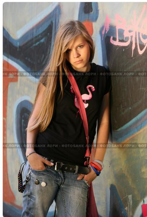
Девушка-тинейджер