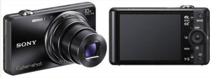
Automatic digital cameras