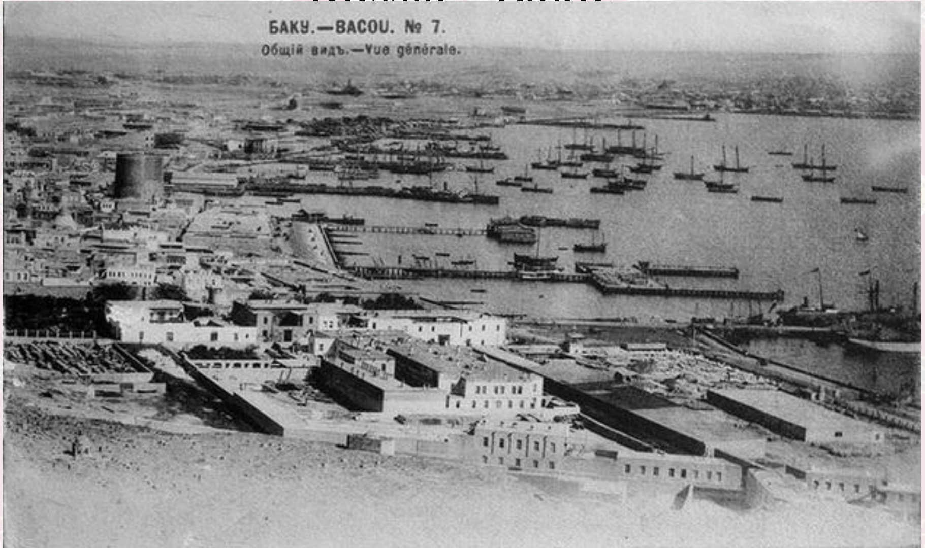
БАКУ.—ВАСОУ. № 7. Общій видъ.—Vue générale.

Landau was born on January 22, 1908 in the main oil-producing center of Russia - Baku