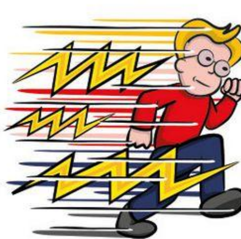
Being very fast.