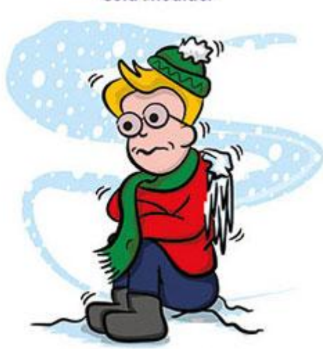
To pay no attention to.