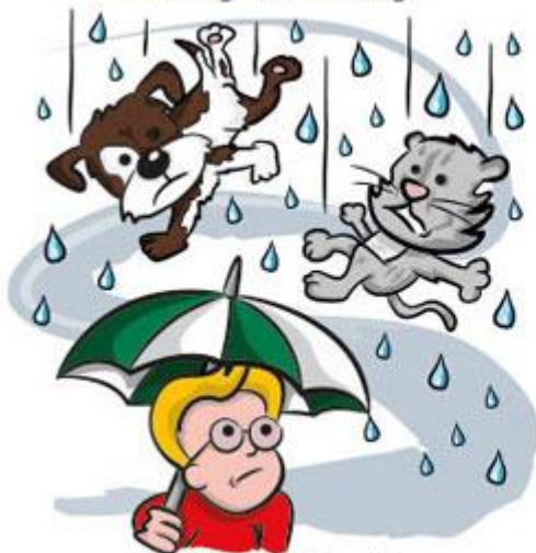
Raining very heavily.