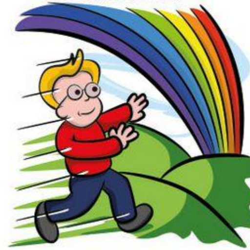
Try to achieve the impossible.