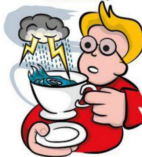
Exaggerate a problem.