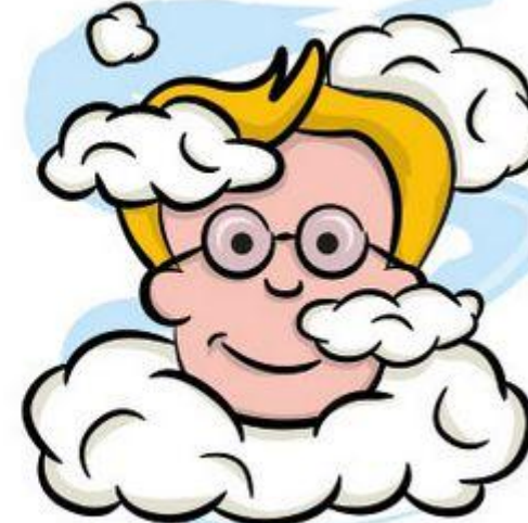
Have unrealistic or impractical ideas.