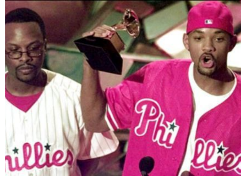
In 1988, will Smith and his friend became the first rappers to be awarded the prestigious Grammy award.