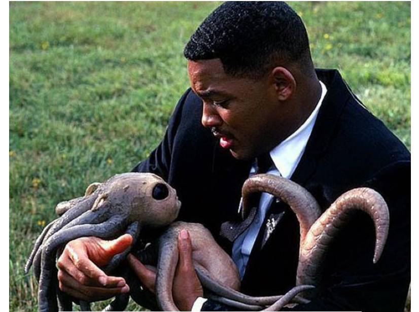
Will Smith in the movie "Men in black"

◦As teens, DJ Jazzy Jeff & The Fresh Prince began producing music, but steered clear of the gangsta rap sound that was emerging from the West Coast by groups like N.W.A. The Fresh Prince rapped about teenage preoccupations in a clean, curse-free style that middle America found safe and entertaining. The pair's first single, "Girls Ain't Nothing But Trouble," was a hit in 1986. Their 1987 debut album, Rock the House , hit the Billboard Top 200, and made Smith a millionaire before the age of 18. The early success put any thoughts of attending college out of Smith's mind.