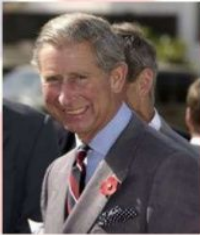
1. Prince Charles, Prince of Wales