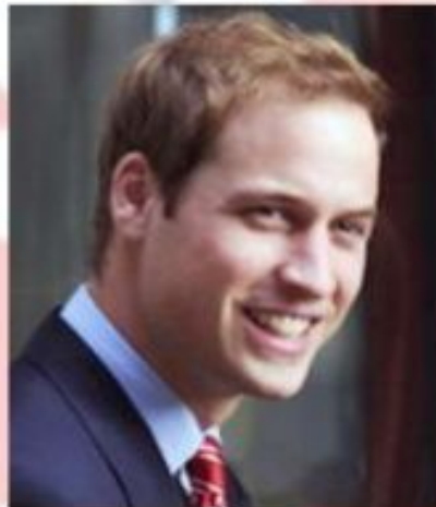
2. Prince William, Duke of Cambridge