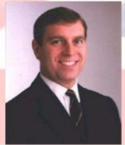
4. Prince Andrew, Duke of York