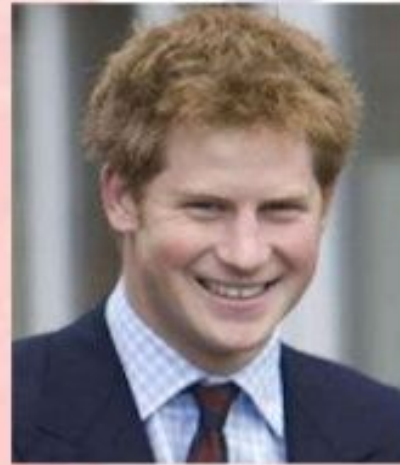
3. Prince Harry