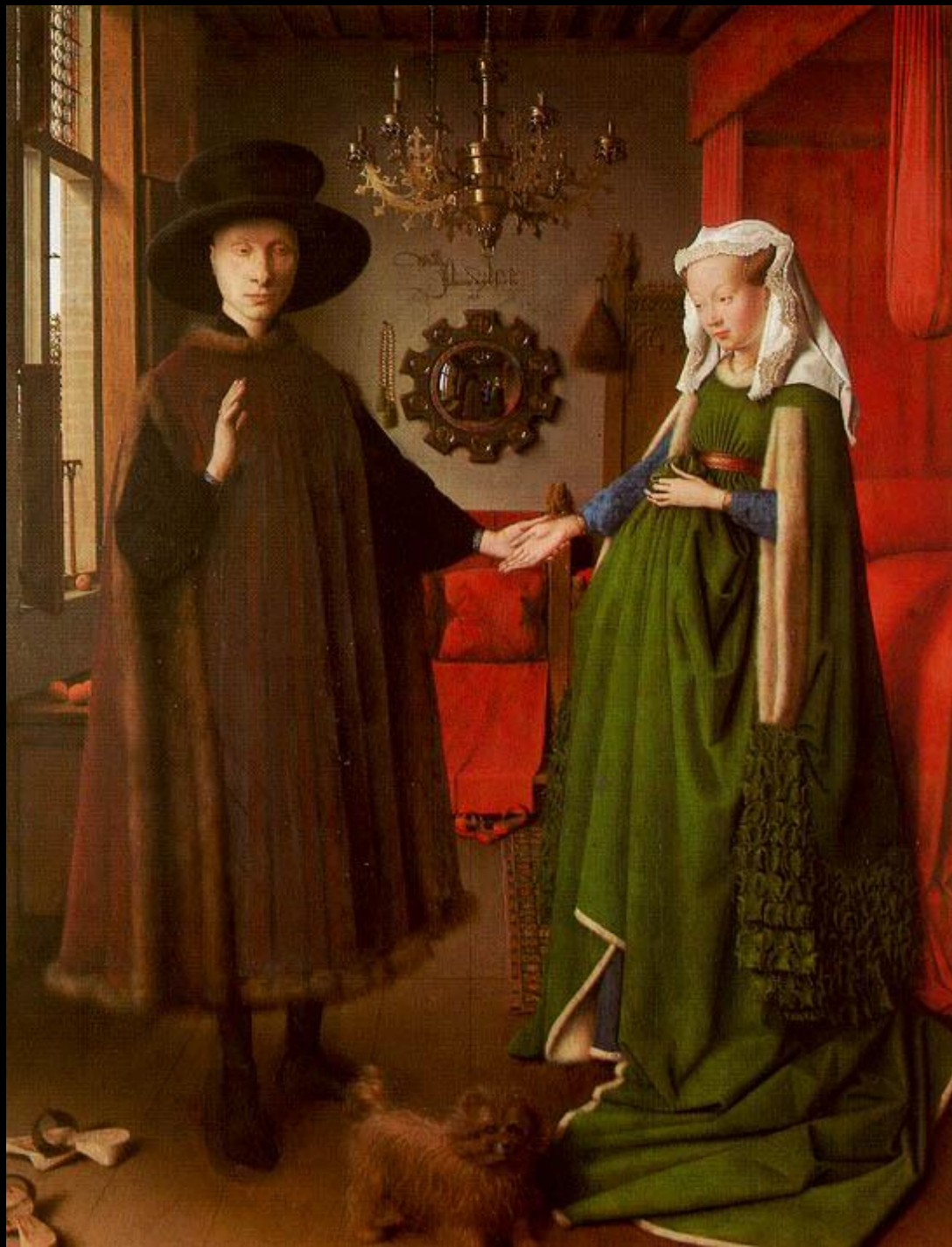
Giovanni Arnolfini and His Bride Jan Van Eyck, 1434