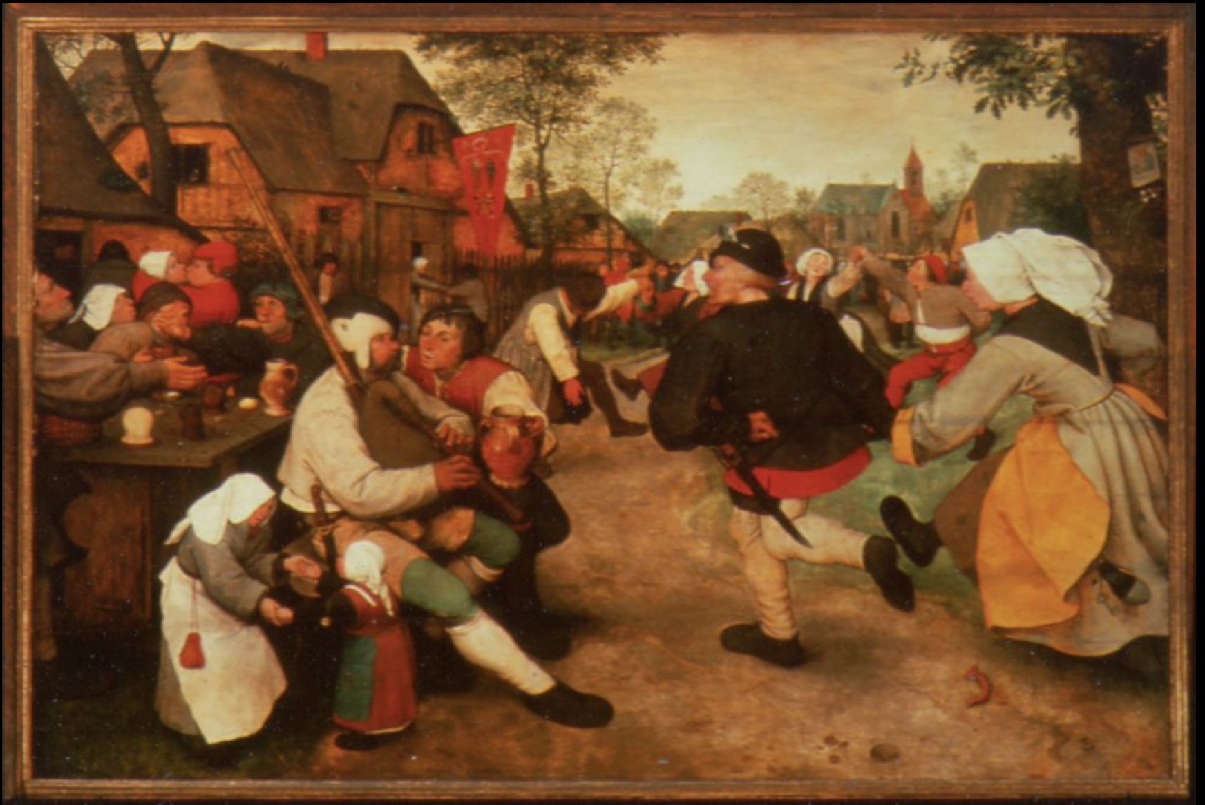
The Peasant Dance , Pieter Bruegel the Elder