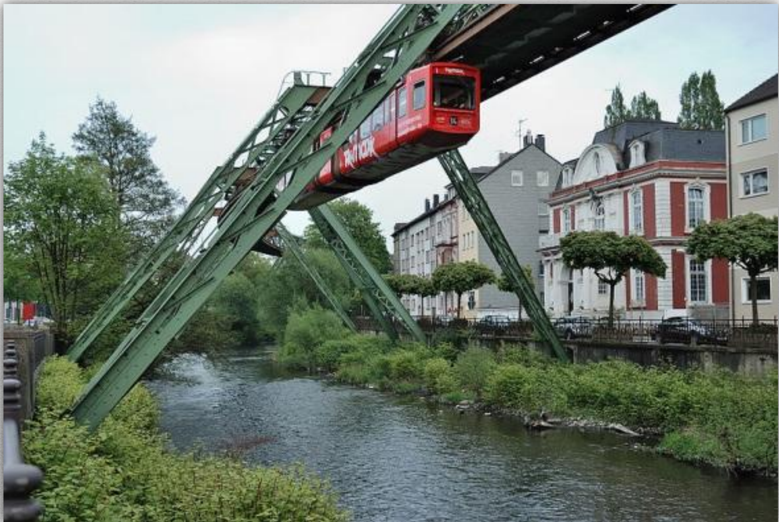
A train in Wuppertal in 2010