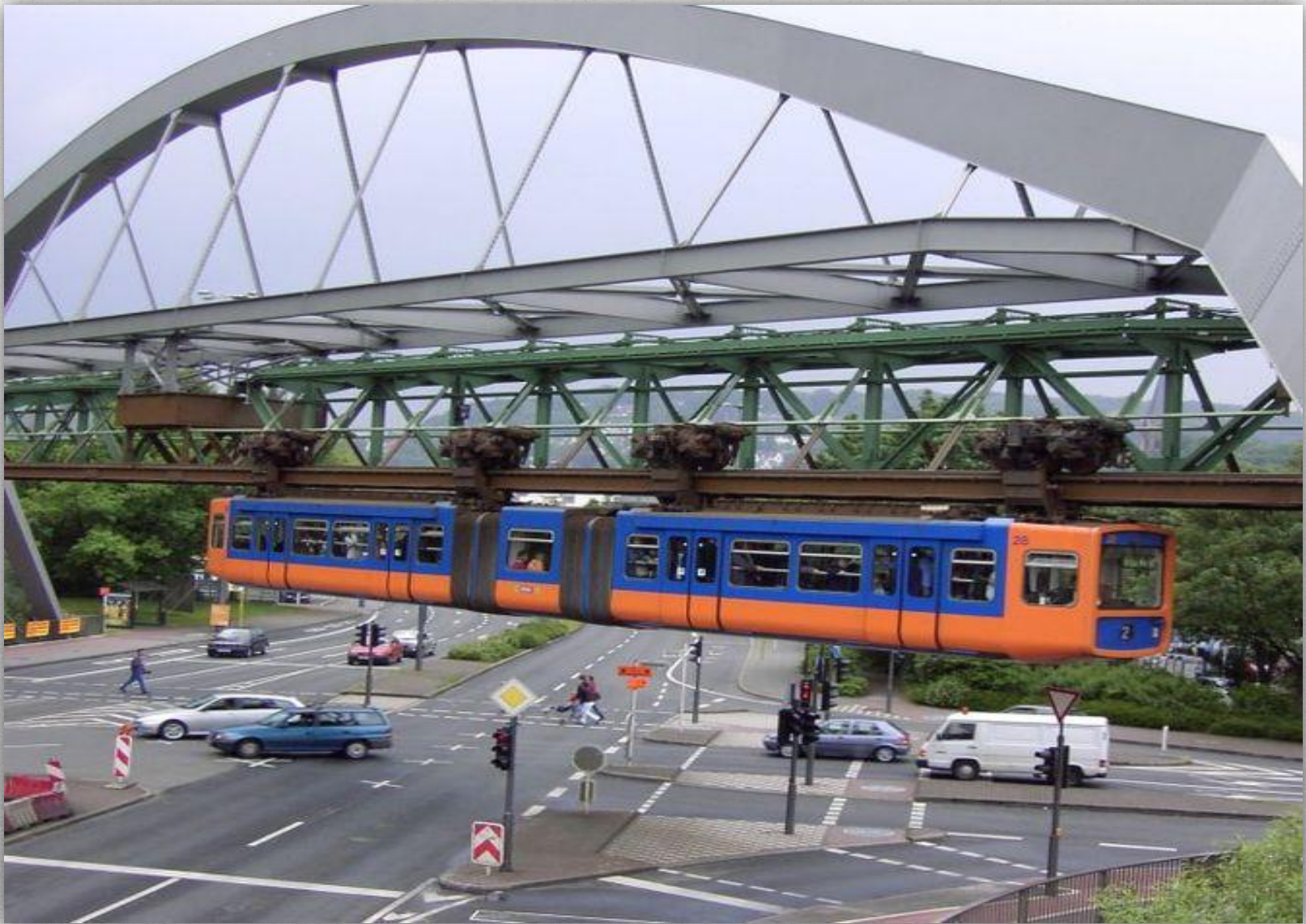
A 1977 train crossing an intersection