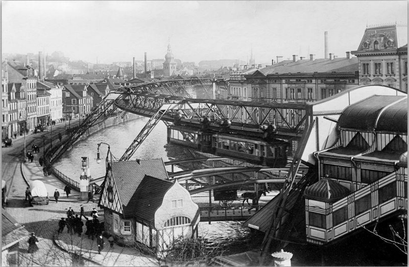
Werther Brücke station in 1913