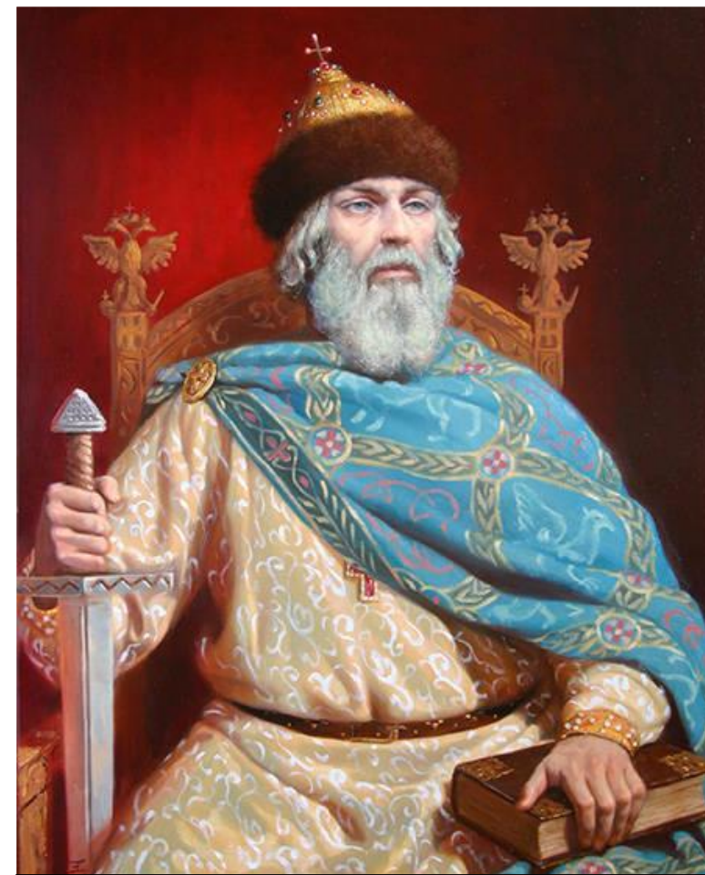
Vladimir Monomahh (1113–1125 )