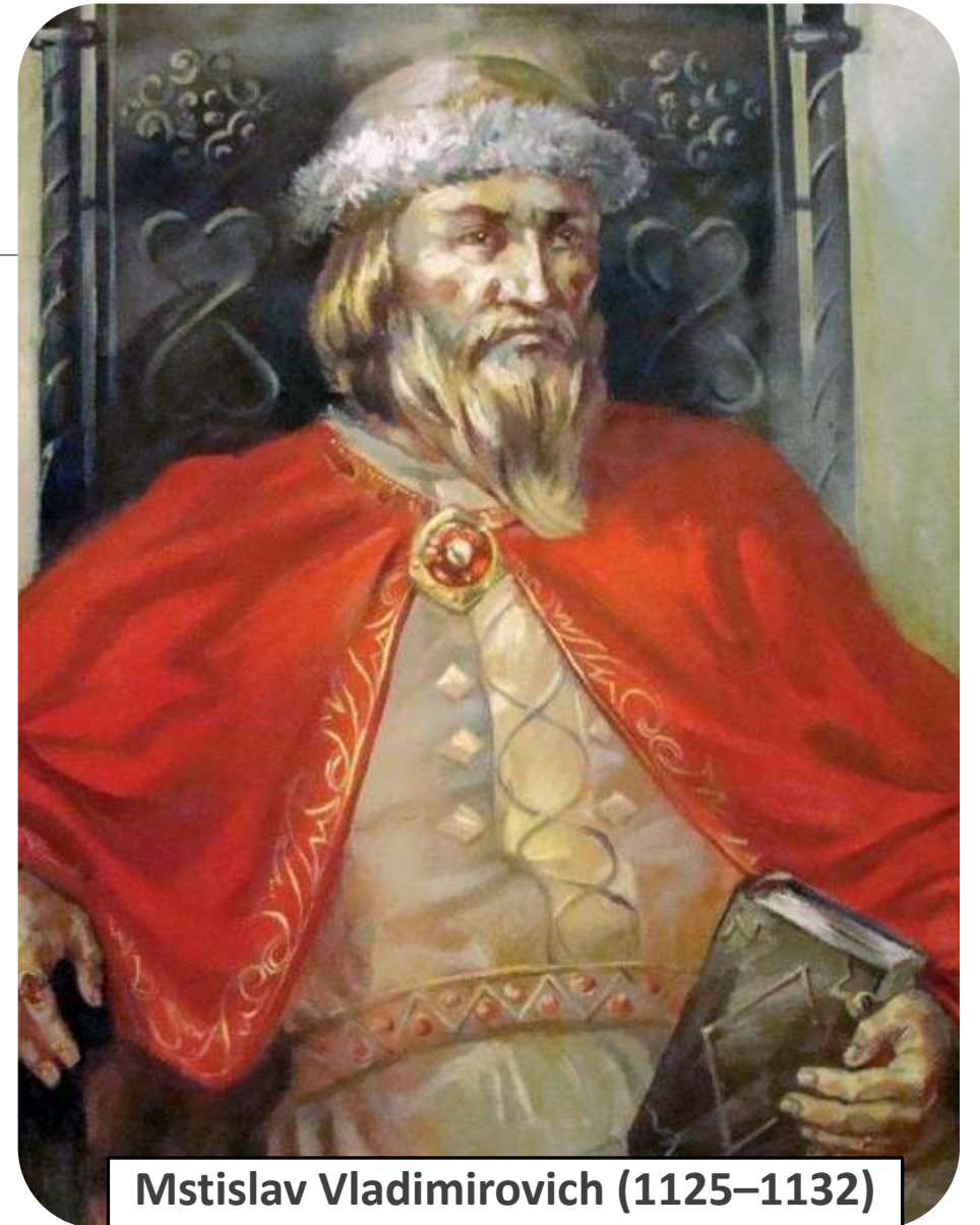
Mstislav Vladimirovich (1125–1132)