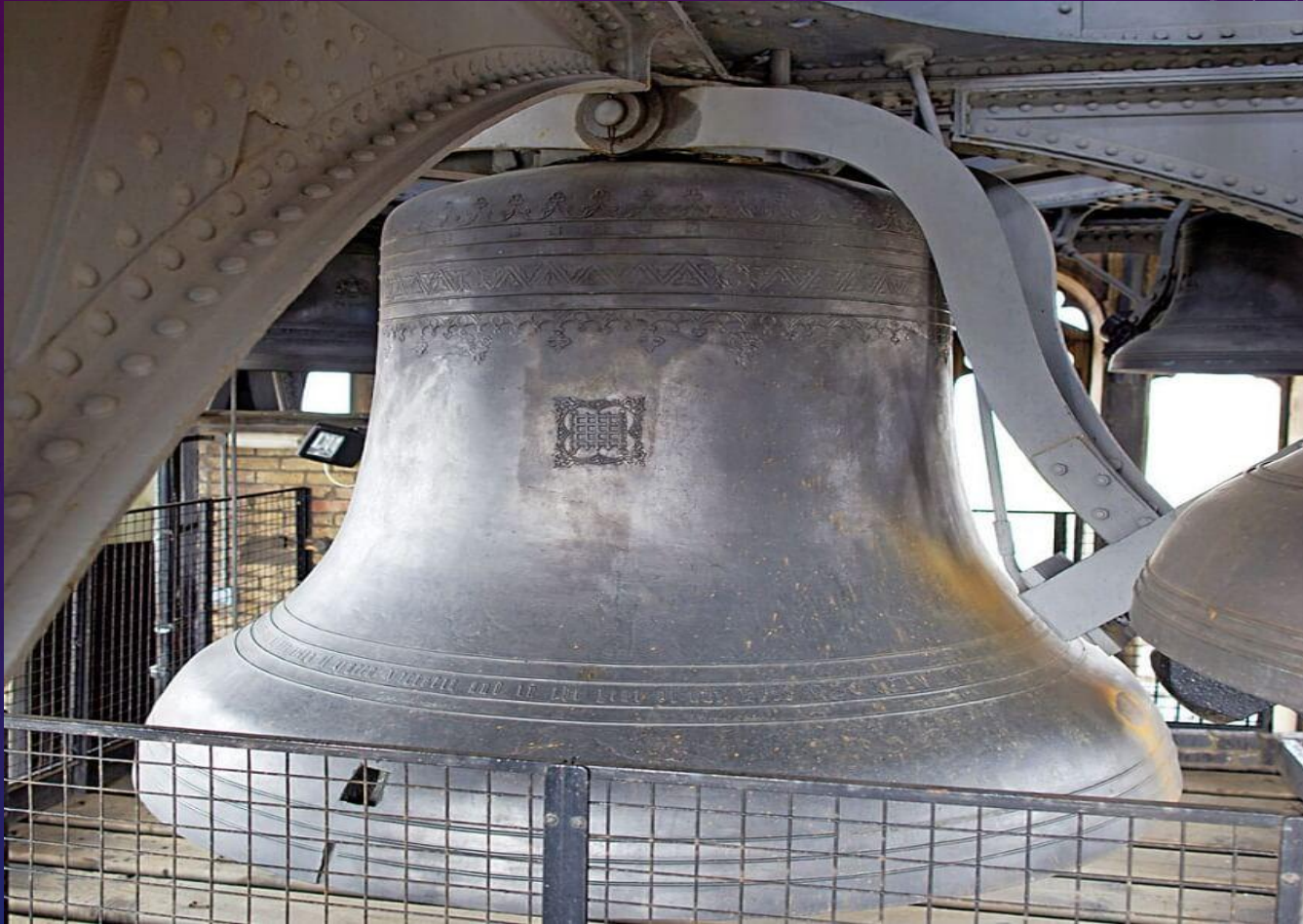
Bell Big bell