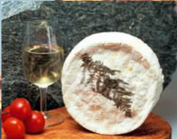
Coeur de Chevre