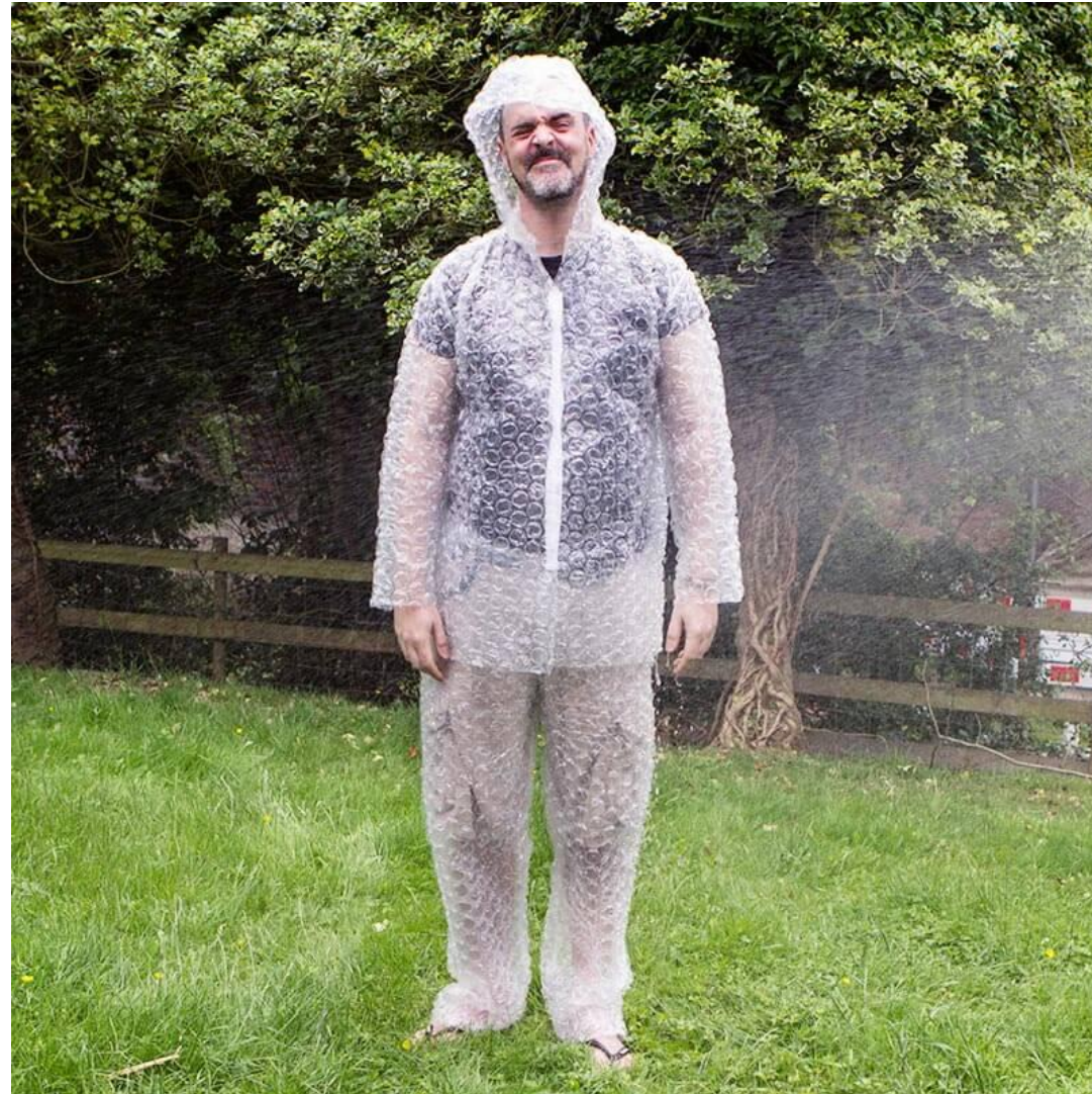
Bubble wrap costume