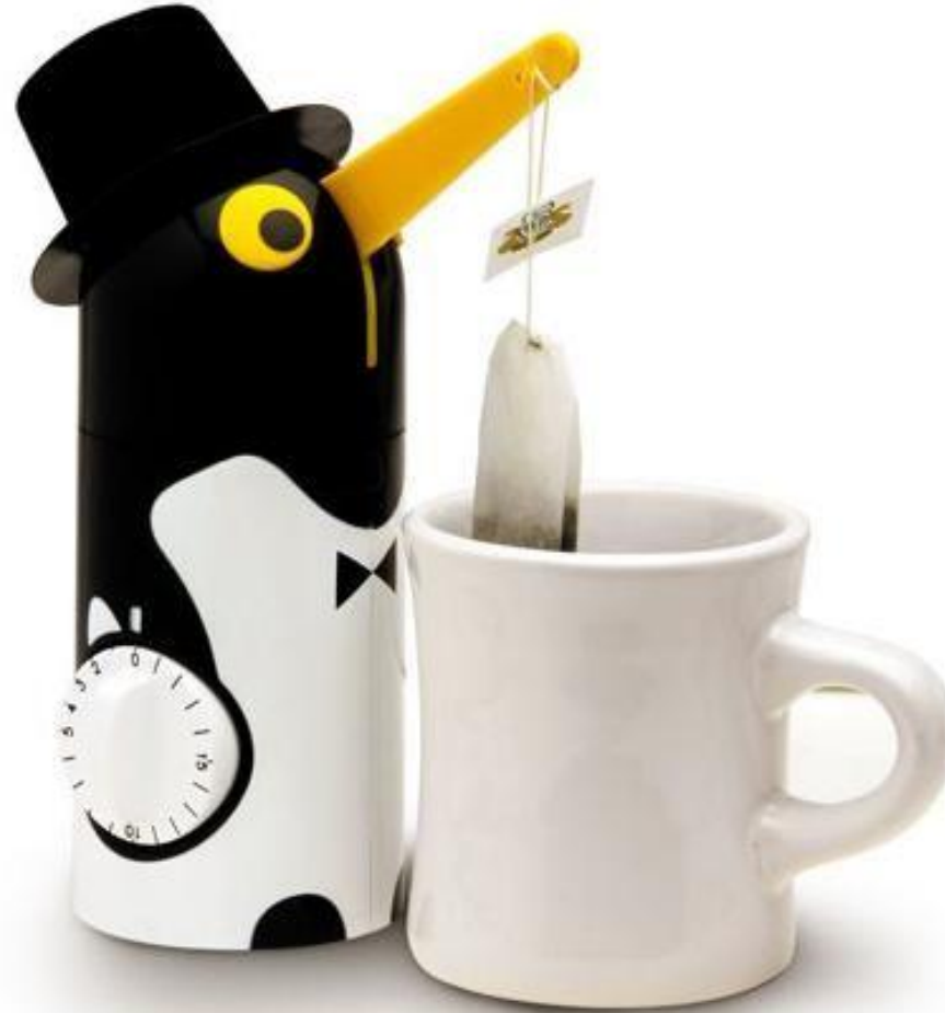
Tea bag putter