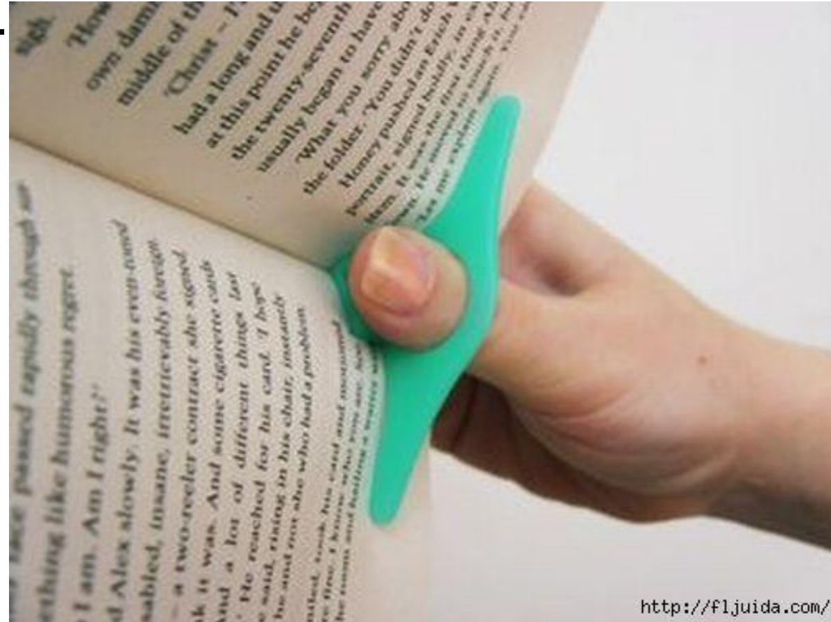
Book page holder