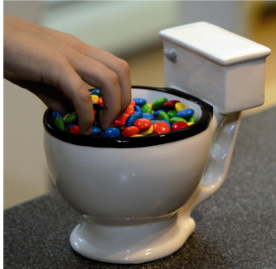
Toilet for candies