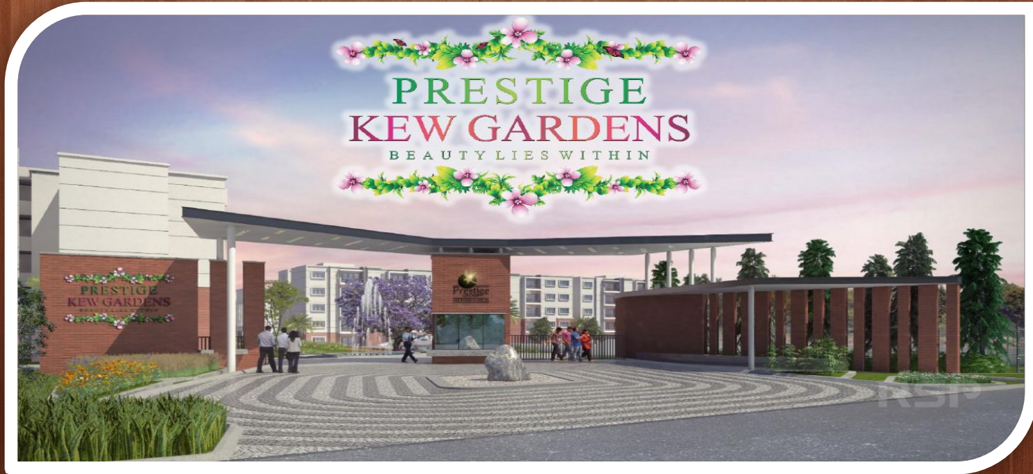
Prestige Kew Gardens Yemalur Near Marathahalli HAL Area Bangalore