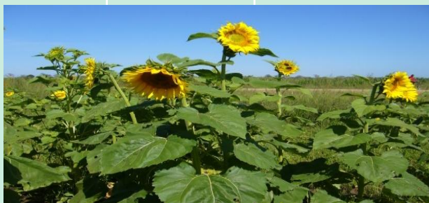
Sunflower Farm in Mbarali