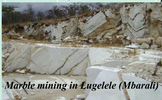
Marble mining in Lugelele (Mbarali)