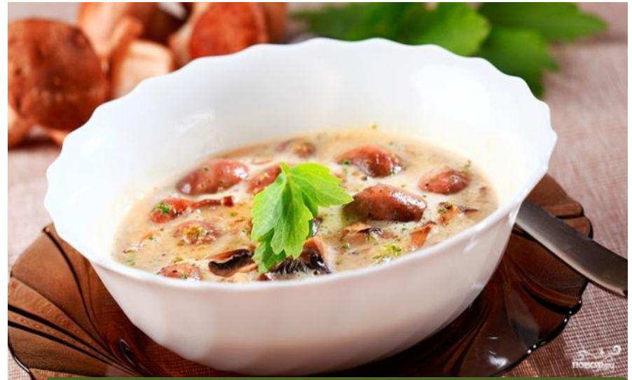
Soup from ryzhik with sour cream