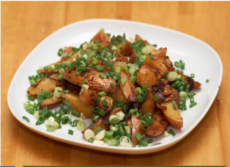
Roast ryzhik with potatoes