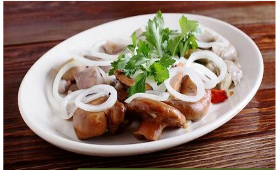
Pickled ryzhik with onion