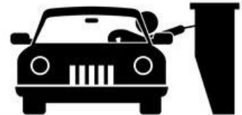
Automatic Pay Station (Exit)