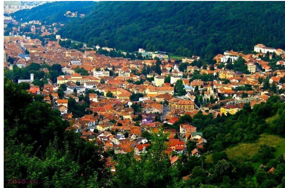
Brasov city surroundings