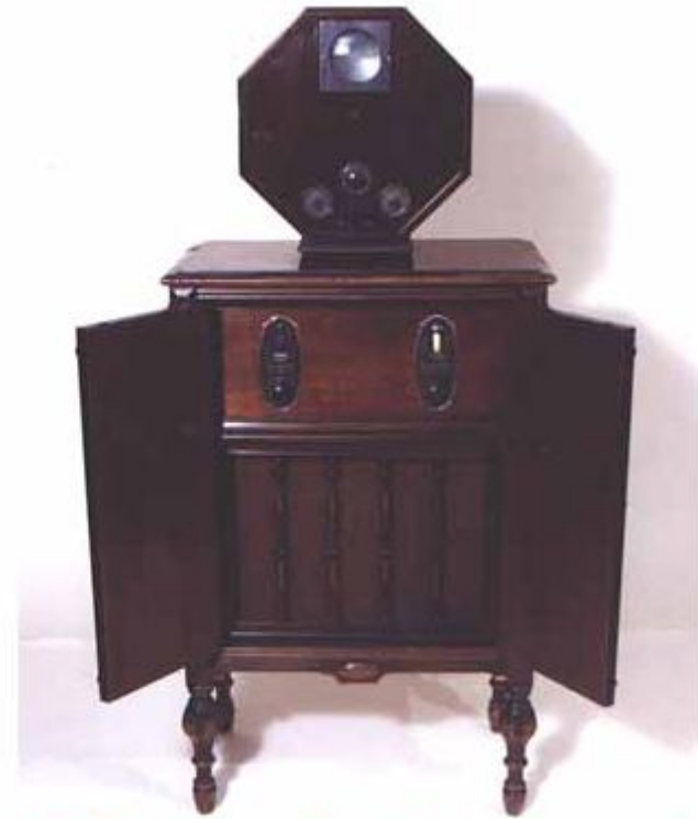
1928 G.E. Scanning Disk Television Set (closed-open)