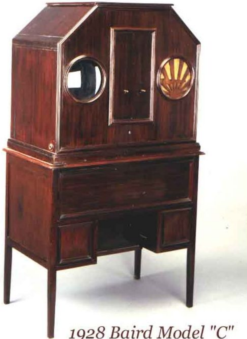
1928 Baird Model "C"