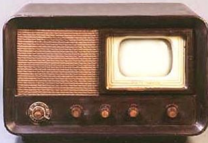
1948 Philco 48-700 7" (USA)