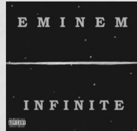
Infinite, First album

After his debut album Infinite (1996), Eminem achieved mainstream popularity in 1999 with his The Slim Shady LP , which earned him his first Grammy Award for Best Rap Album. His next two releases, 2000's The Marshall Mathers LP and 2002's The Eminem Show , were worldwide successes, with each being certified diamond in US sales and both winning Best Rap Album Grammy Awards—making Eminem the first artist to win the award for three consecutive LPs. They were followed by Encore in 2004, another critical and commercial success. Eminem went on hiatus after touring in 2005, releasing Relapse in 2009 and Recovery in 2010. Both won Grammy Awards and Recovery was the best-selling album of 2010 worldwide—the second time he had the international best-selling album of the year (after The Eminem Show ). Eminem's eighth album, 2013's The Marshall Mathers LP 2 , won two Grammy Awards, including Best Rap Album; it expanded his record for the most wins in that category and his Grammy total to 15.