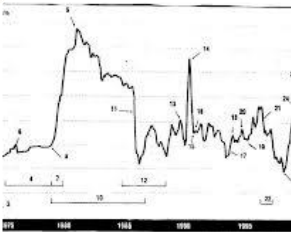
1 picture illustrated dynamics of inventions which has a tendency nowadays 2 picture illustrated that Human ability are more powerful and aspiration and possibility much broader and absolutely amazing than can appeal thought about endless Mighty Forces that can be turned as a benefit as an evil