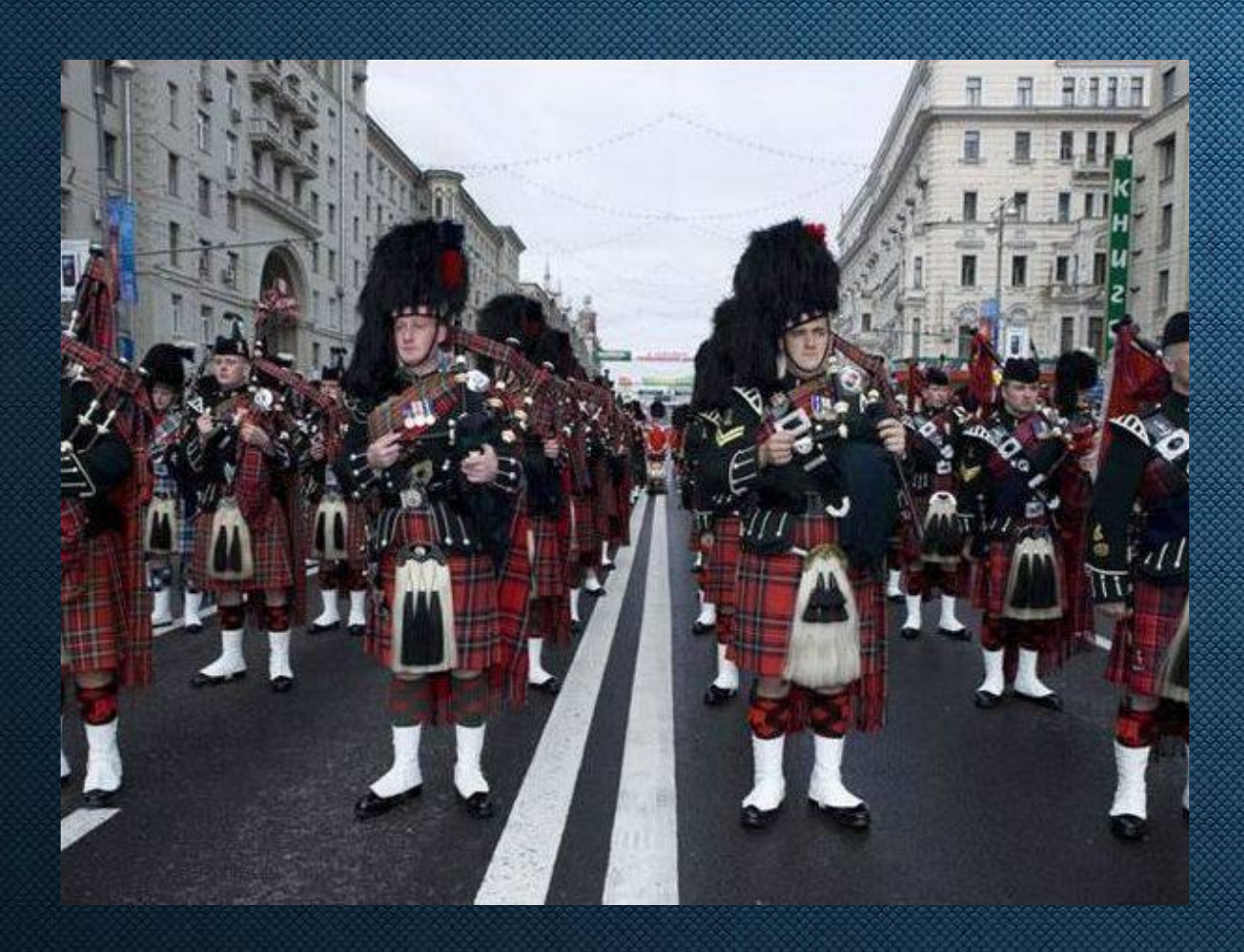
There are still many countries where wearing a kilt, but they're almost the same