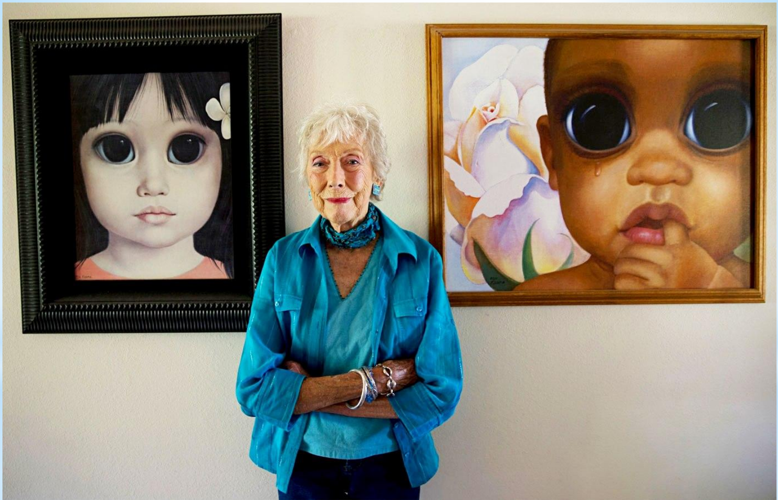
Margaret Keane (1927)