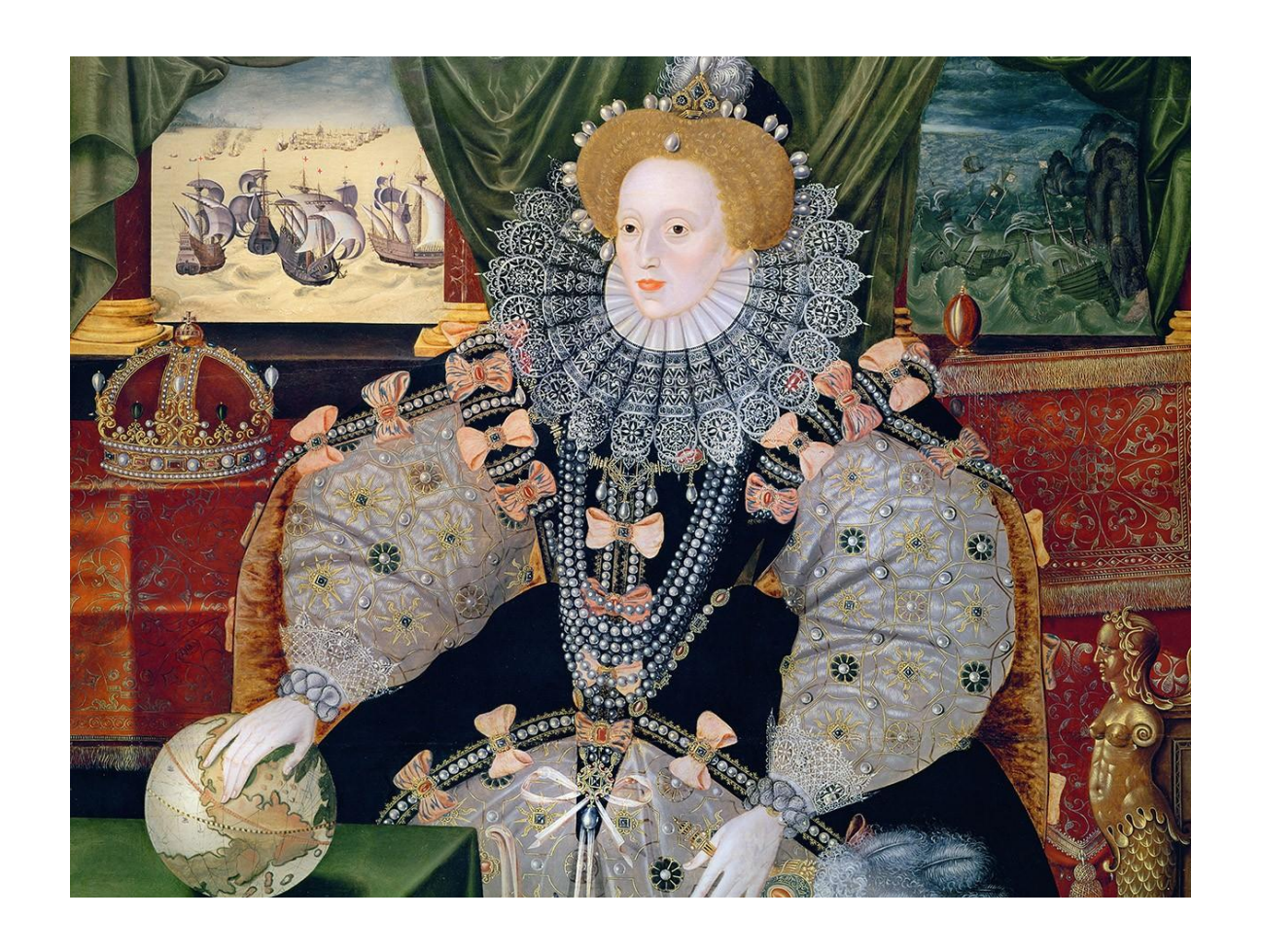
The Faerie Queene