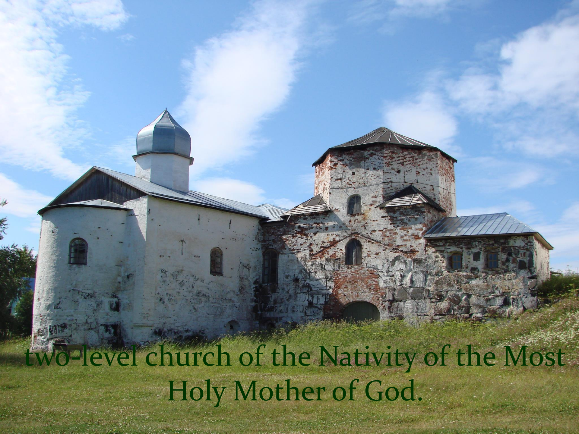
two-level church of the Nativity of the Most Holy Mother of God.