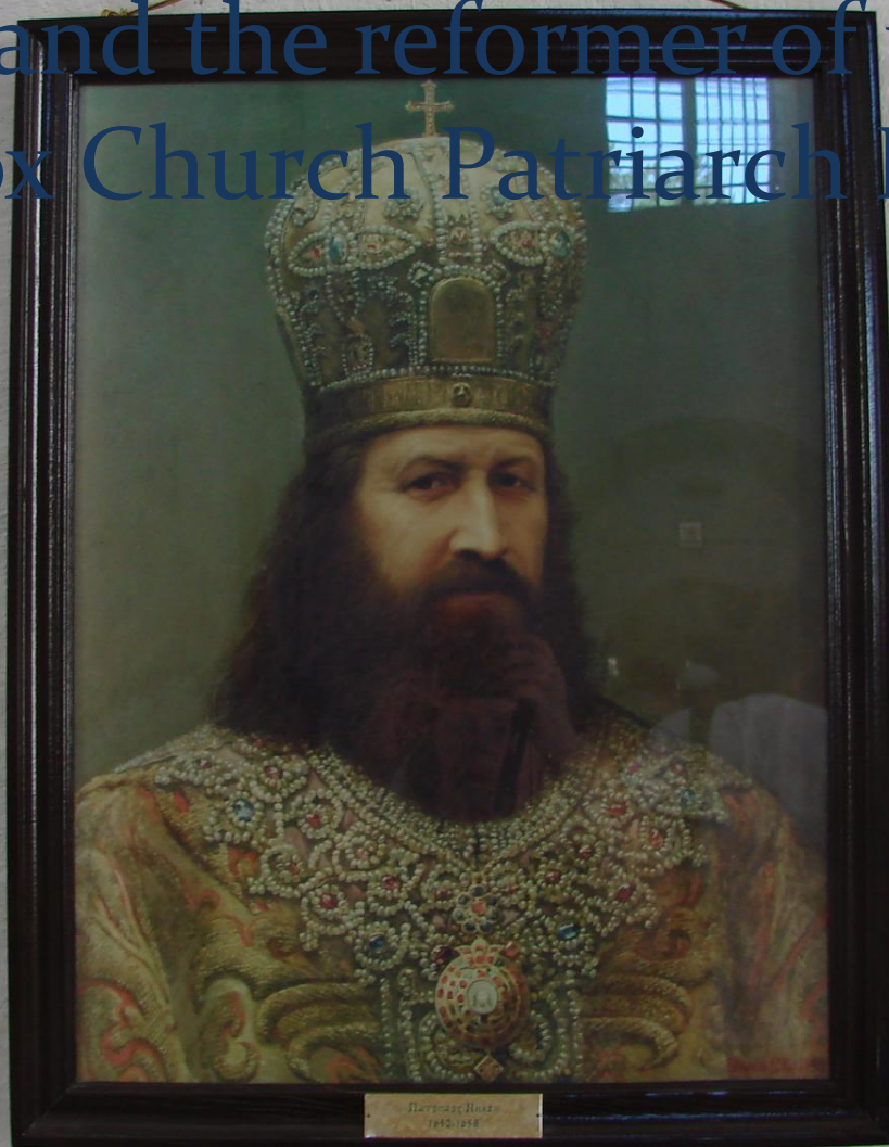
Патриарх Никон 1652-1691

The history of Kiy-island is closely connected with the name of a famous religious figure of XVII century and the reformer of the Russian Orthodox Church Patriarch Nikon.