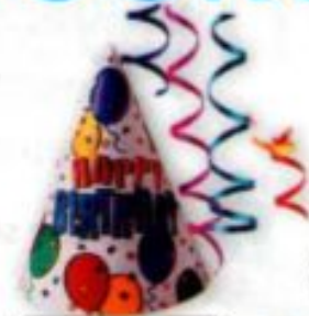
have a party