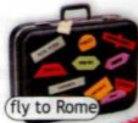
fly to Rome