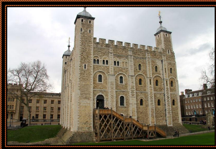
b) The White Tower