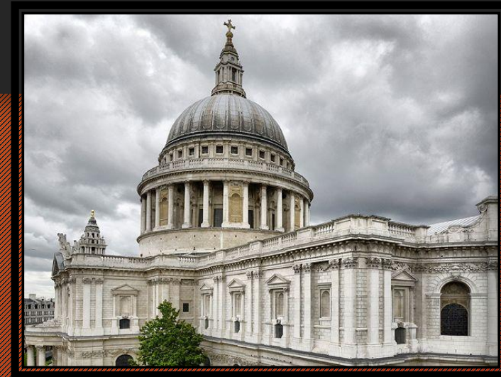
d) St. Paul's Cathedral