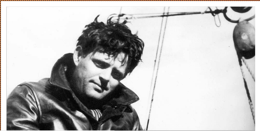
a) Jack London

Who of these writers wasn't born in the UK?