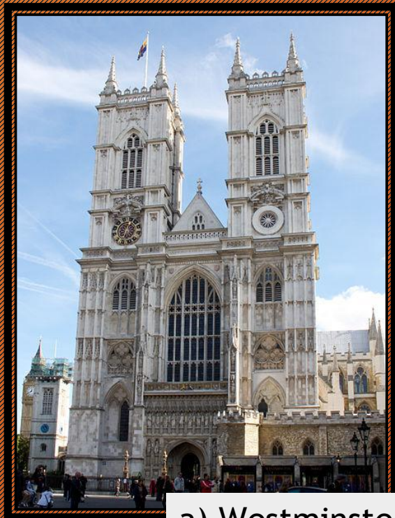
a) Westminster Abbey