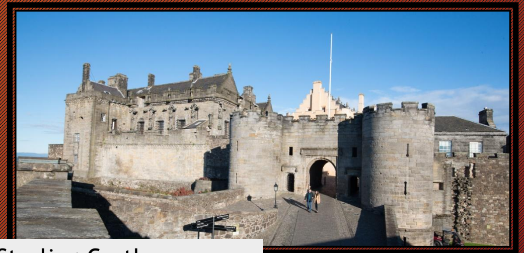
c) Sterling Castle