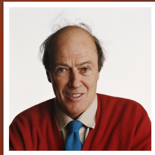
d) Roald Dahl