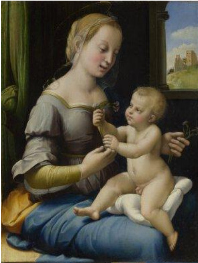
The Madonna of the Pinks about 1506-7, Raphael