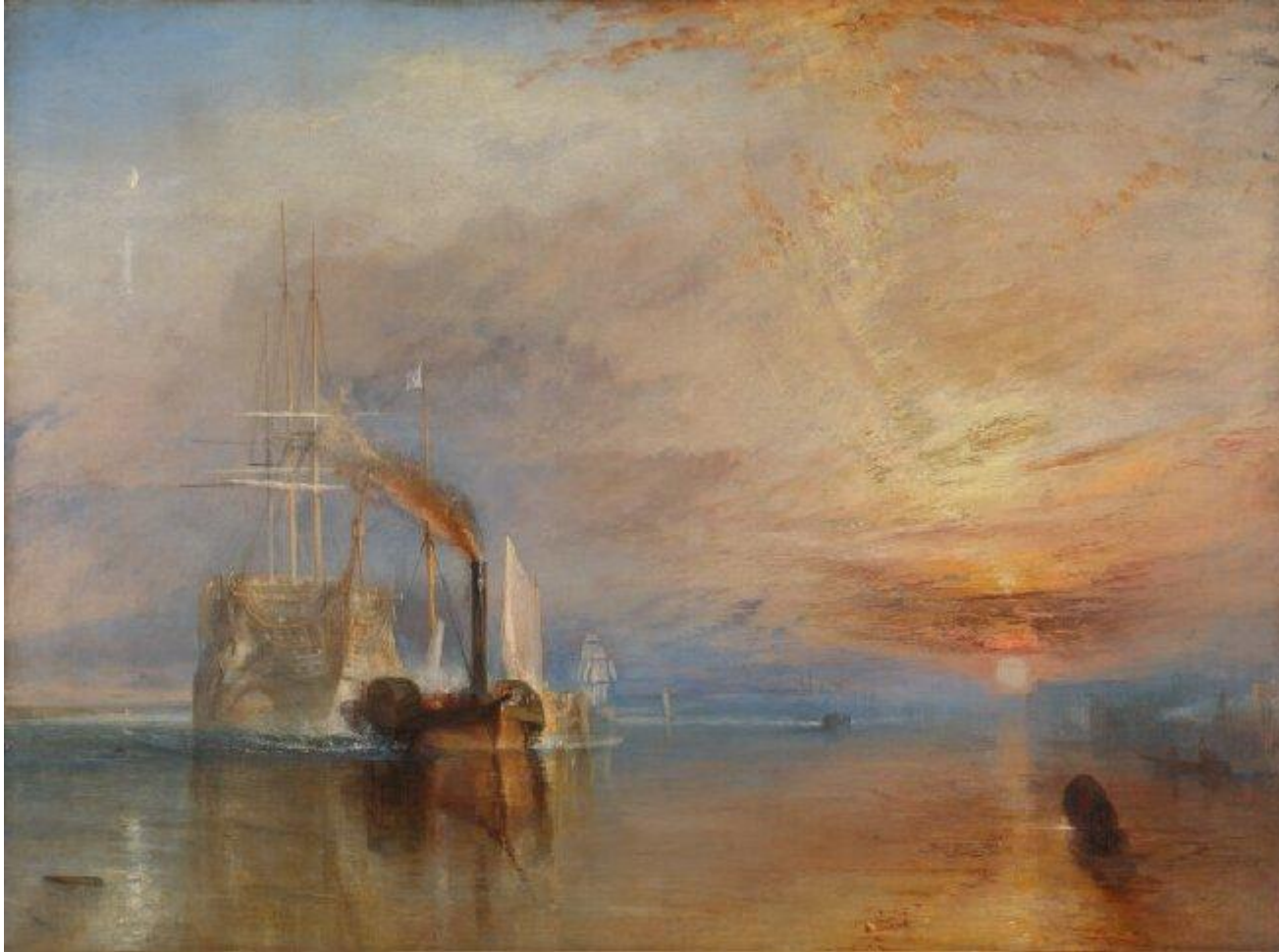
The Fighting Temeraire 1839, Joseph Mallord William Turner