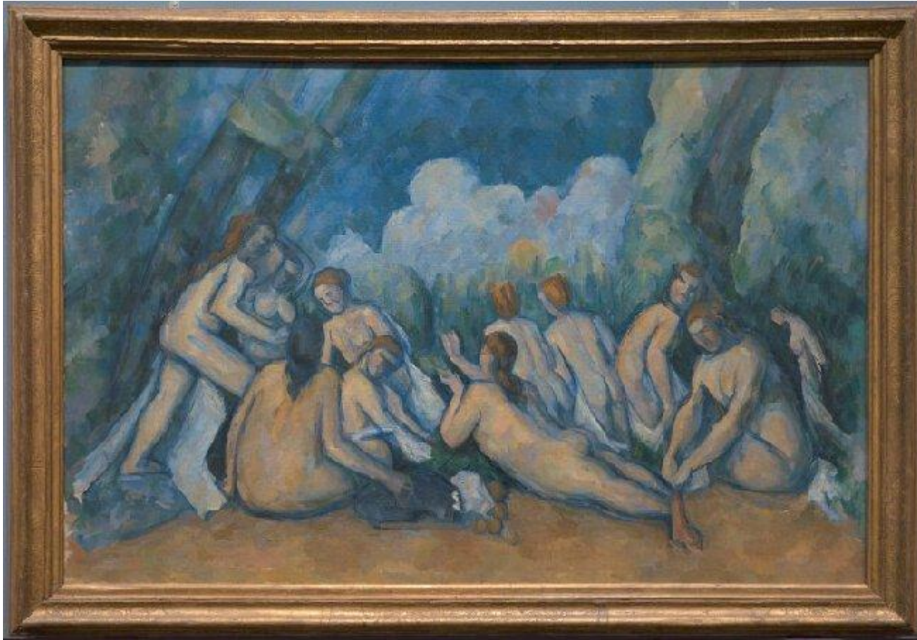
Bathers (Les Grandes Baigneuses)