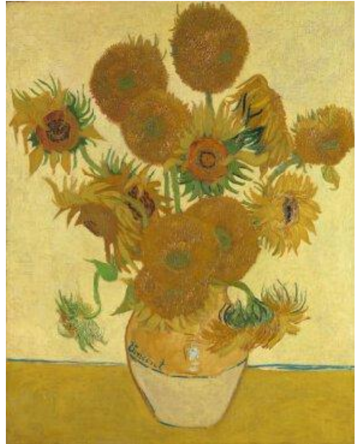
Sunflowers 1888, Vincent van Gogh