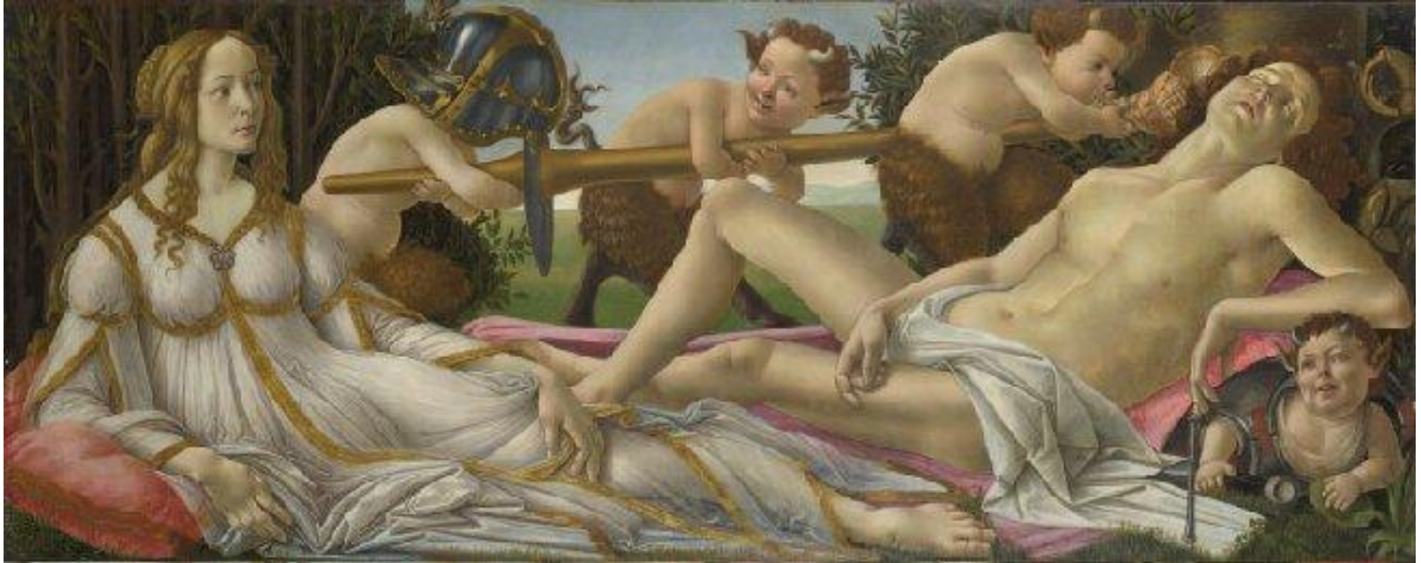
Venus and Mars about 1485, Sandro Botticelli