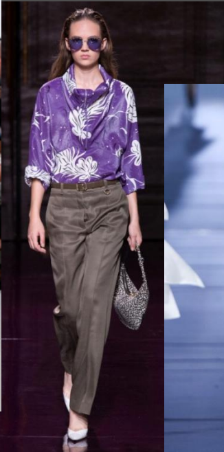
Blouse purple floral print white —collecti on Nina Ricci