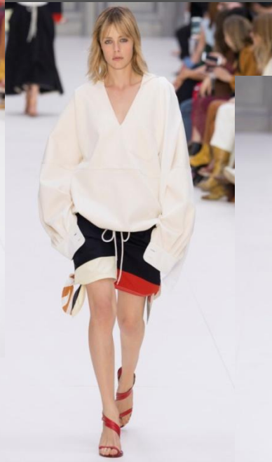
Fashionable blouse white 2017 long-sleeved oversize Chloé.