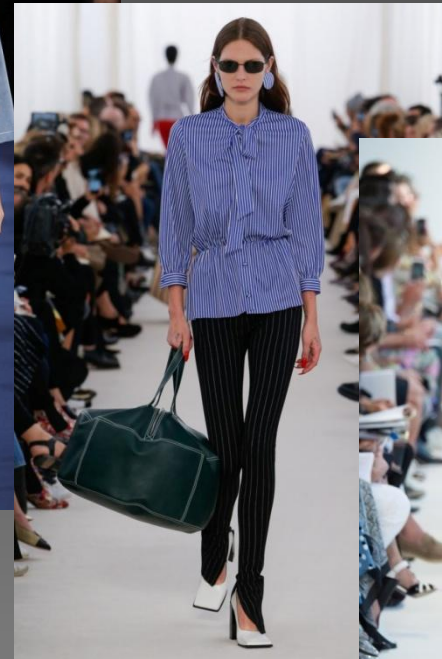
blouse blue 2017-printe d pinstripe — Balenciaga