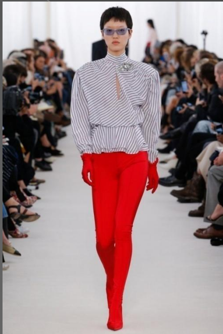
Blouse white 2017-printed pinstripe — fashion review Balenciaga collection.