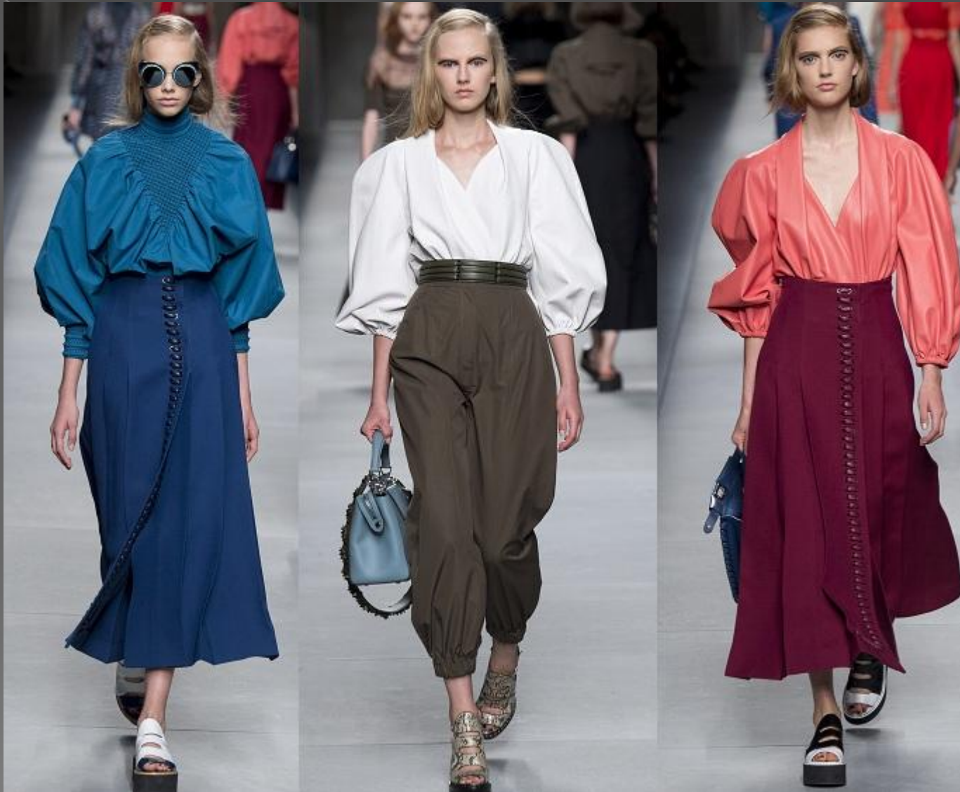
BLOUSES WITH SLEEVES "FLASHLIGHT" L