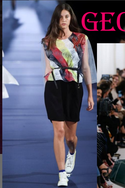
Blouse with printed sleeves of transparent white cloth —of Alexis Mabille.