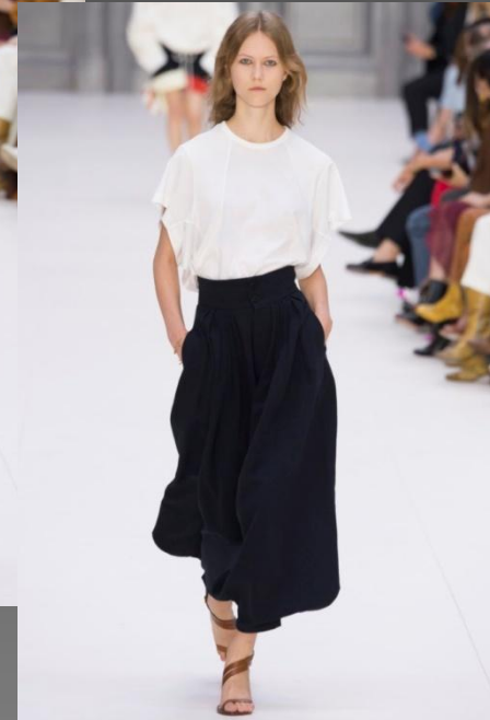
Fashionable blouse white 2017 sleeveless oversize from the collection of Chloé.