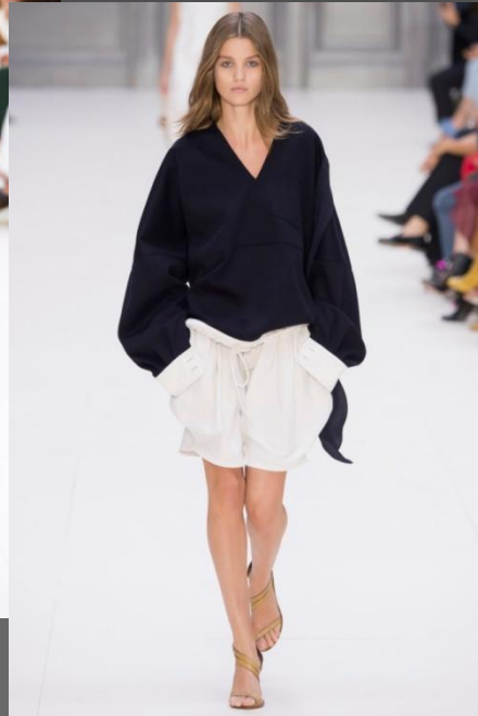
Fashionable blouse black 2017 long-sleeved oversize from the collection of Chloé