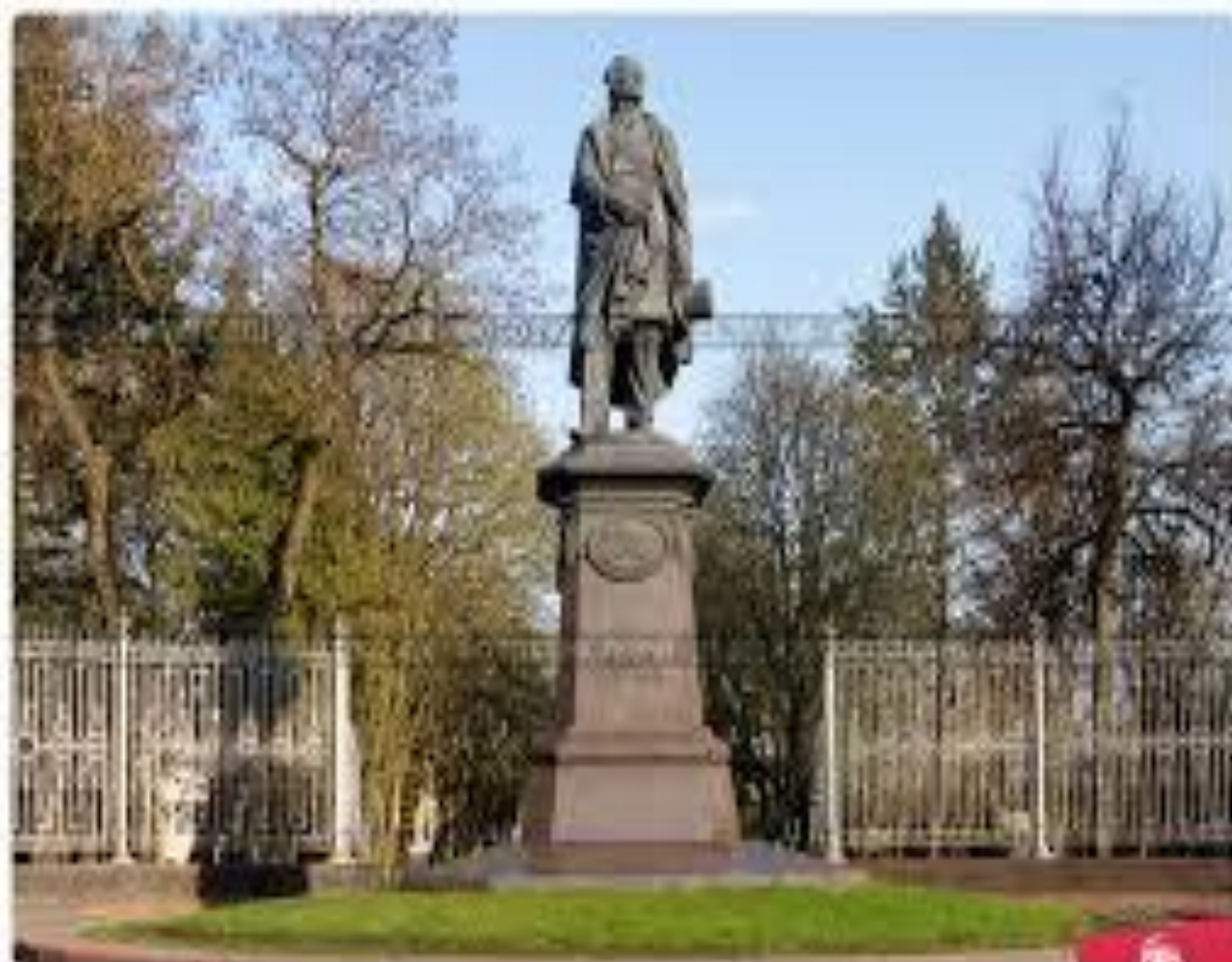
Памятник Ф.И. Тютчеву в Бранске