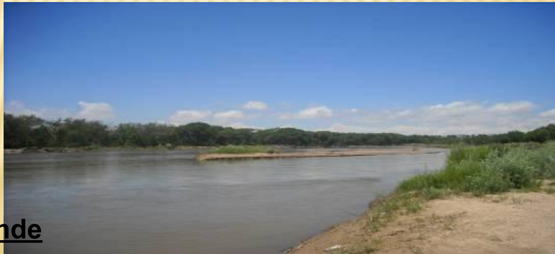
The Rio Grande