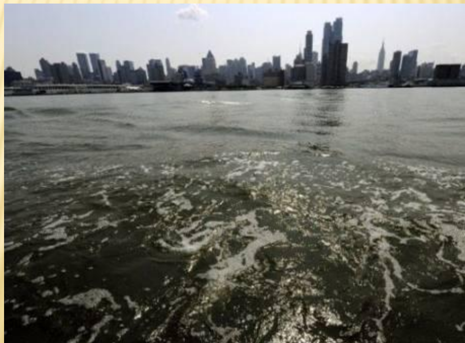
The Hudson river