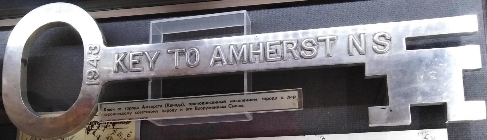
Ключ от города Амхерста (Канада), преподнесенный населением города в дар героическому советскому народу и его Вооруженным Силам.

LONDON, JANUARY 21 (AP)—(UPI)—THE CHAIRMAN OF THE PRESIDIUM OF THE SUPREME COUNCIL OF THE UNION OF SOVIET SOCIALIST REPUBLICS HAS TODAY IN A MESSAGE TO THE PEOPLES OF THE SOVIET UNION, IN WHICH HE RECALLED THE HEROIC QUALITIES AND VALIANT LEADERSHIP OF THE RED ARMY IN ITS STRUGGLE AGAINST THE GERMAN INVADERS WHO BY THE HUNDREDS OF THOUSANDS WROTE NEW PAGES TO HISTORY. STALIN SAID THE UNYIELDING RESISTANCE OF STALINGRAD THAT TURNED THE TIDE AND HERALDED THE ONSET OF THE END OF THE WAR HAVE STRUCK DEEP INTO THE CONSCIENCE AND HEEDS TO THE DARKENED MINDS OF THE ENEMY AND THE PEOPLES OF THE BRITISH EMPIRE HAVE GIVEN DEMANDS FOR THE PREPARATION OF A SECOND FRONT WHICH IT WOULD GIVE NO PLEASURE TO PRESENT TO THE CITY OF STALINGRAD STOP WE HOPE TO BE THAT THIS GREAT BATTLE IS THE HAPPIER TIMES TO COME THE UNLEASHED COURAGE WITH WHICH THE HEROIC CITY STEELLED HERSELF AGAINST THE POWERFUL AND PERSISTENT ONSLAUGHTS OF HER ASSAILANTS AND THAT IT WOULD BE A TOKEN OF THE ADMIRATION WE HOLD FOR THE BRITISH PEOPLES FOR THE BRITISH CITIZENS