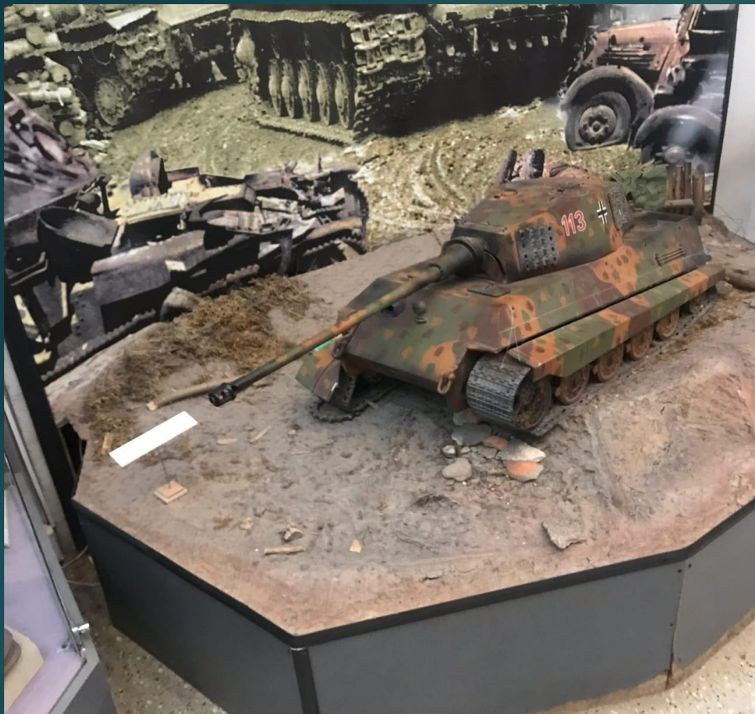
«Королевский тигр», с башней Хеншель