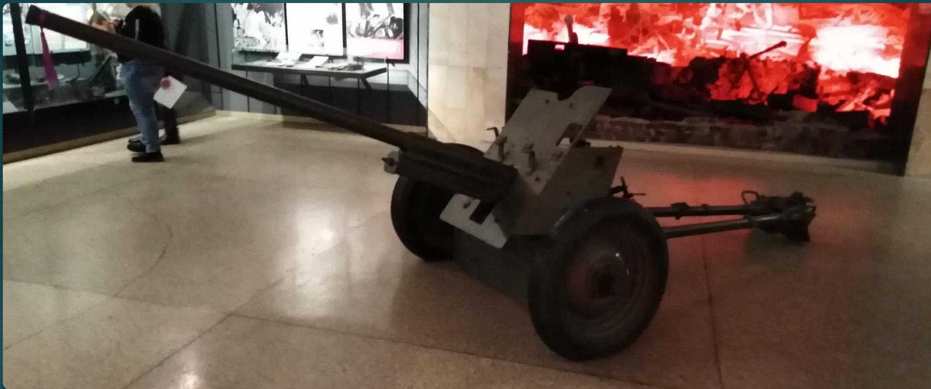
45-мм противотанковая пушка образца 1937 года (53-К)