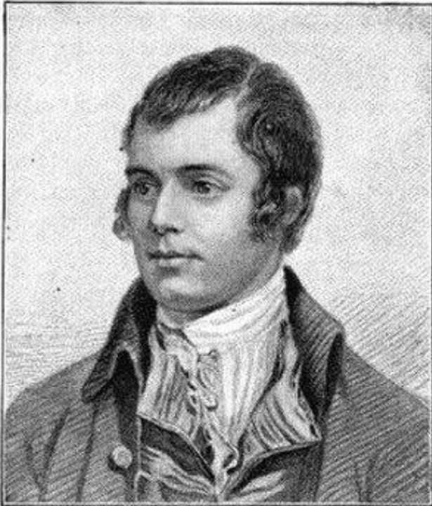
From the painting by Nasmyth, National Portrait Gallery.