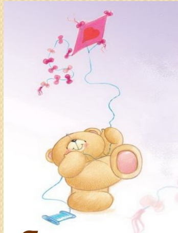
fly a kite