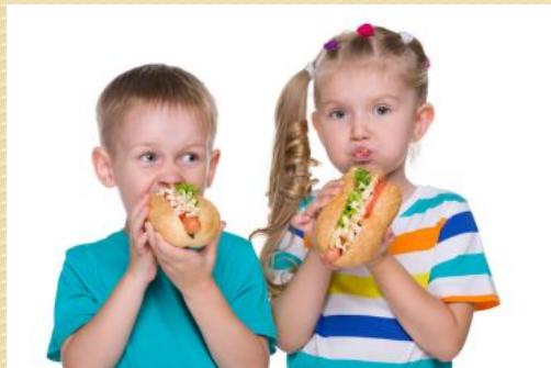
wear a mac eat a hot dog