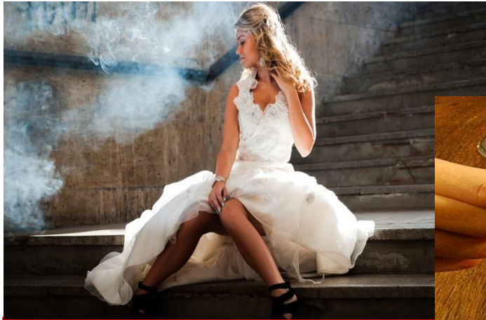
Stealing the Bride (Brautraub)