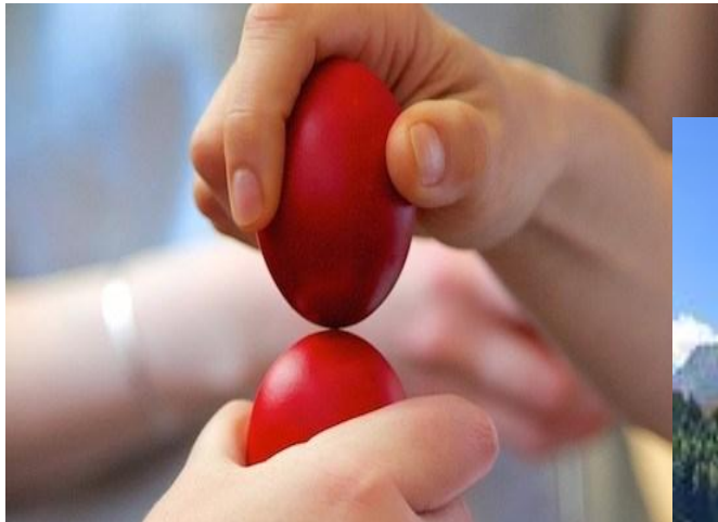
Easter Egg battle (Eierpecken)