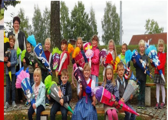
First day of school cone (Schultüte)