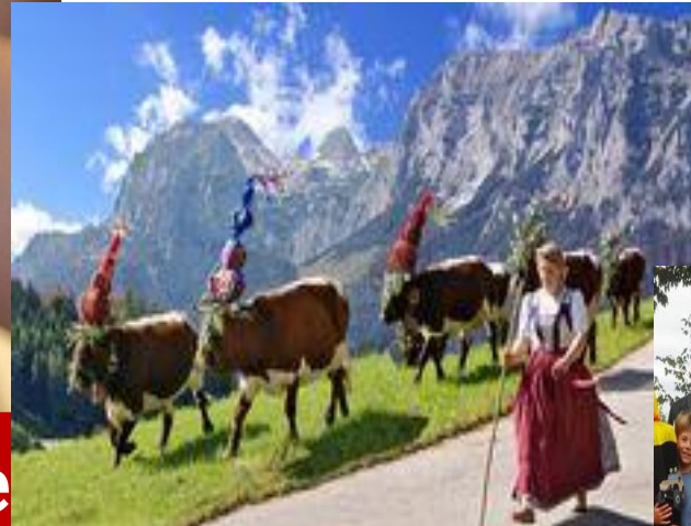
Autumn Cow train (Almabtrieb)