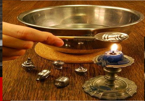
Lead pouring, Molybdomancy (Bleigießen)