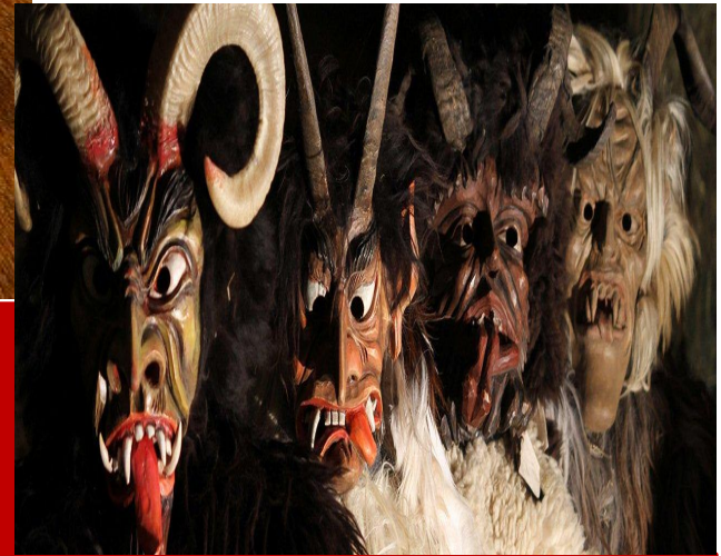
Scary mask processions (Perchtenlaufen)