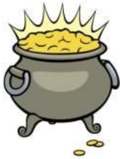
Pot of gold