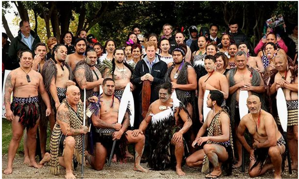
Ethnic composition (2006)

New Zealand has a population of around 3.5 million, of whom 13 % are Maori.